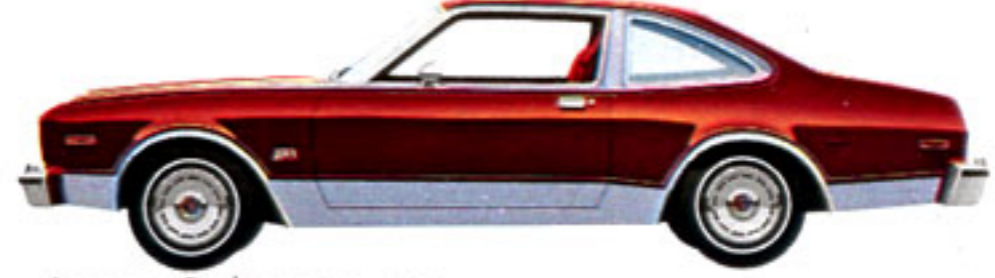
Aspen 2-door coupe