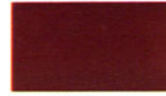
Russet Sunfire Metallic