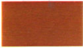
Caramel Tan Metallic