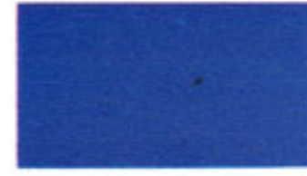
Regatta Blue Metallic