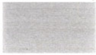
Silver Cloud Metallic