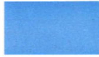
French Racing Blue