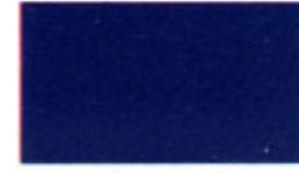
Starlight Blue Sunfire Metallic