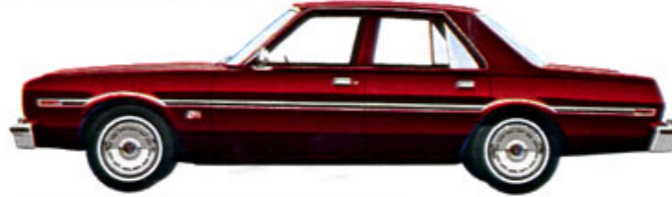
Aspen 4-door Custom sedan