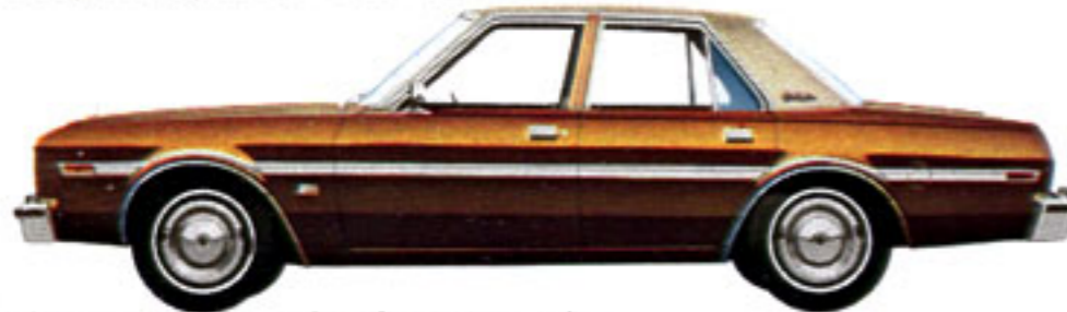
Aspen Special Edition sedan