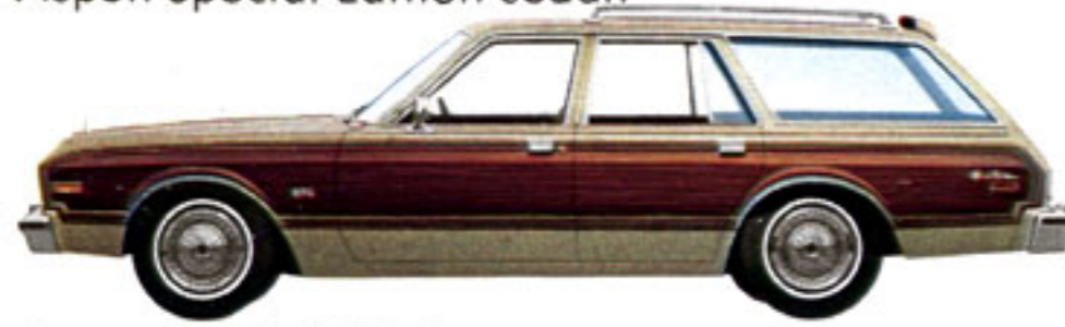
Aspen Special Edition wagon