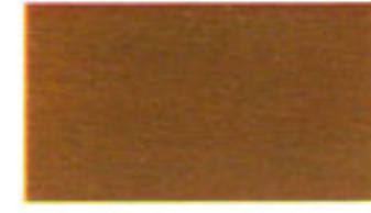
Spanish Gold Metallic