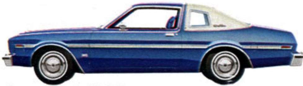
Aspen Special Edition coupe