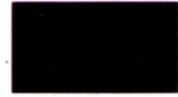
Black Sunfire Metallic