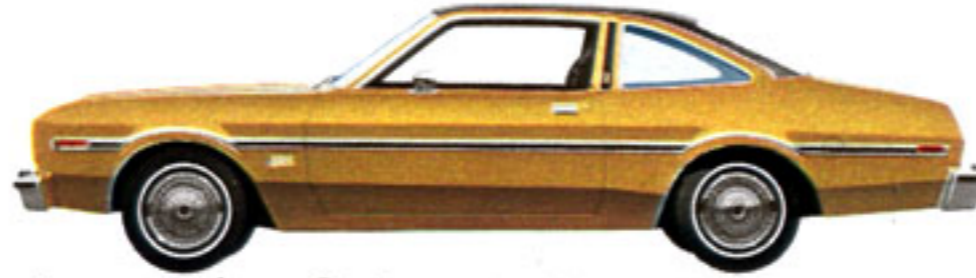
Aspen 2-door Custom coupe