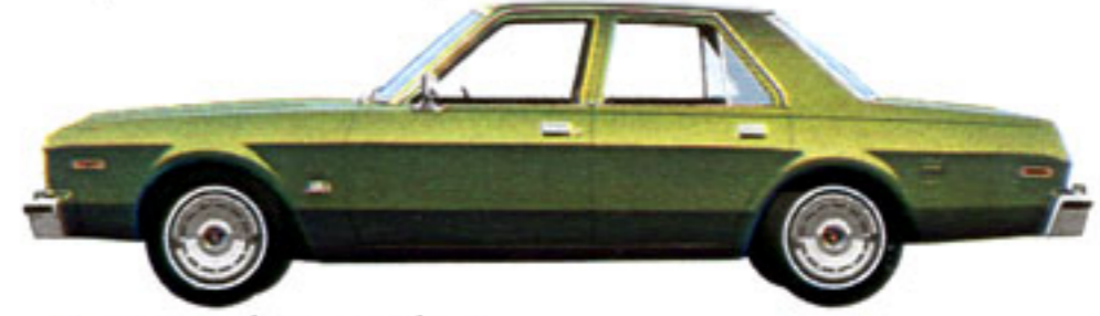
Aspen 4-door sedan