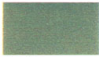
Jade Green Metallic