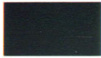
Forest Green Sunfire Metallic