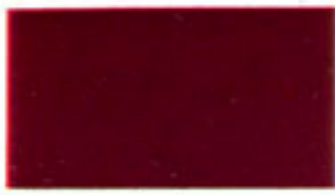
Vintage Red Sunfire Metallic