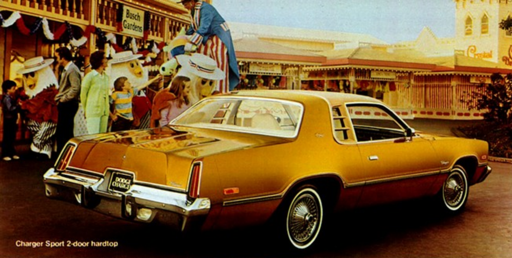
Charger Sport 2-door hardtop