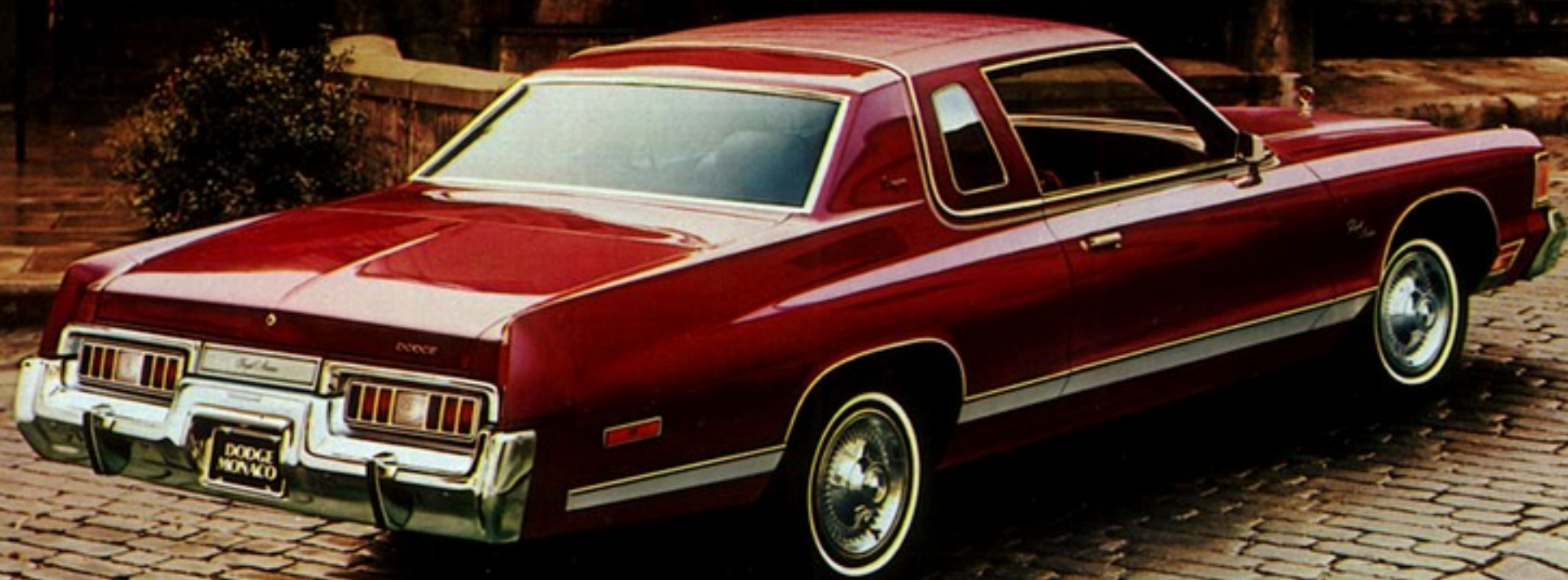
Royal Monaco Brougham 2-door hardtop