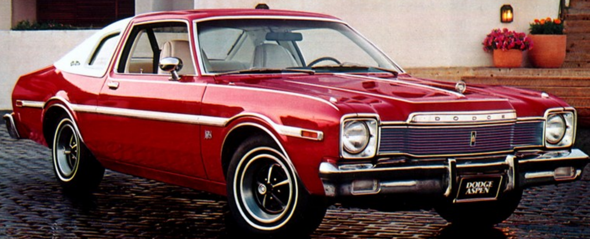
Aspen Special Edition coupe