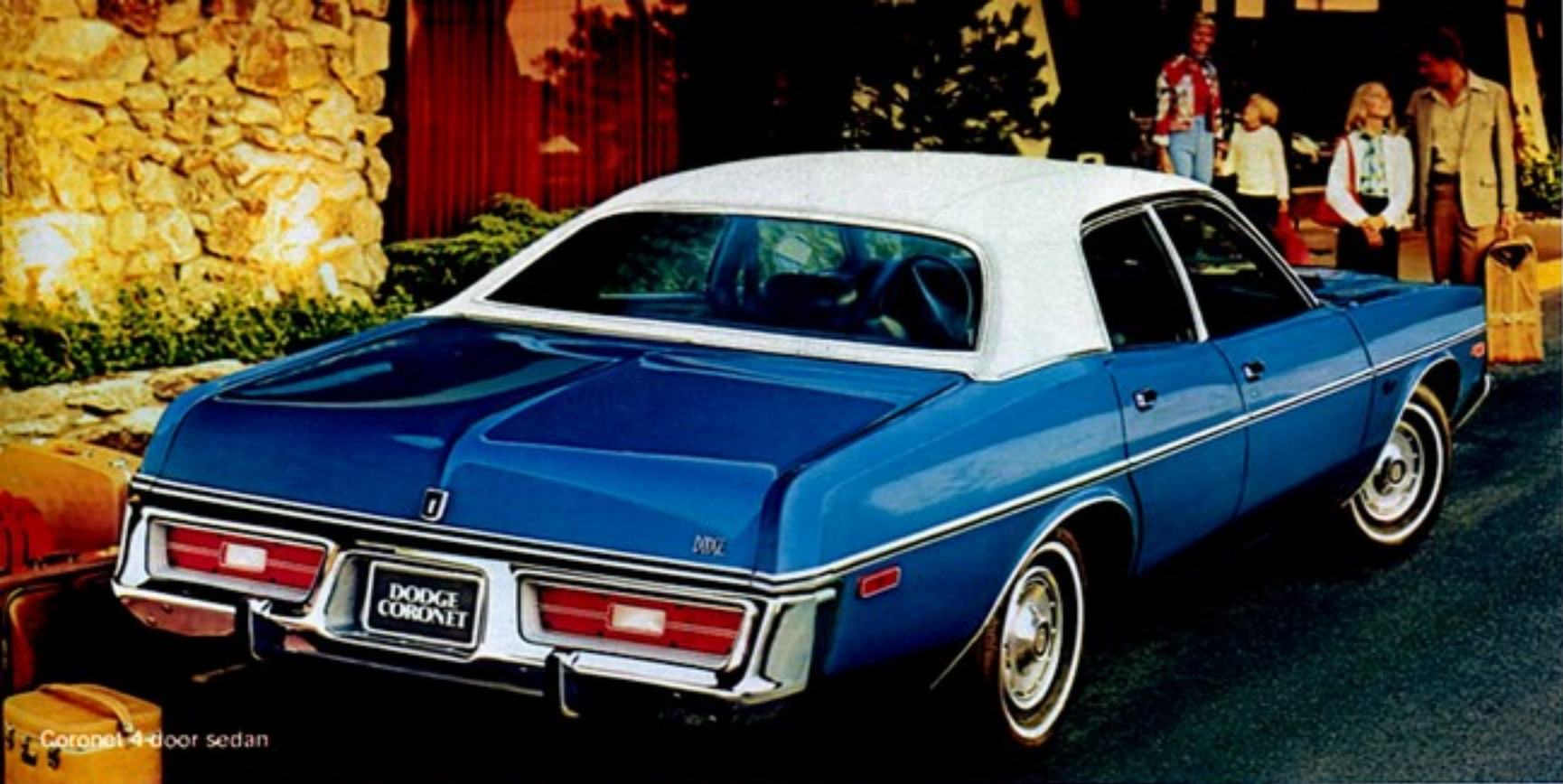
Coronet 4-door sedan