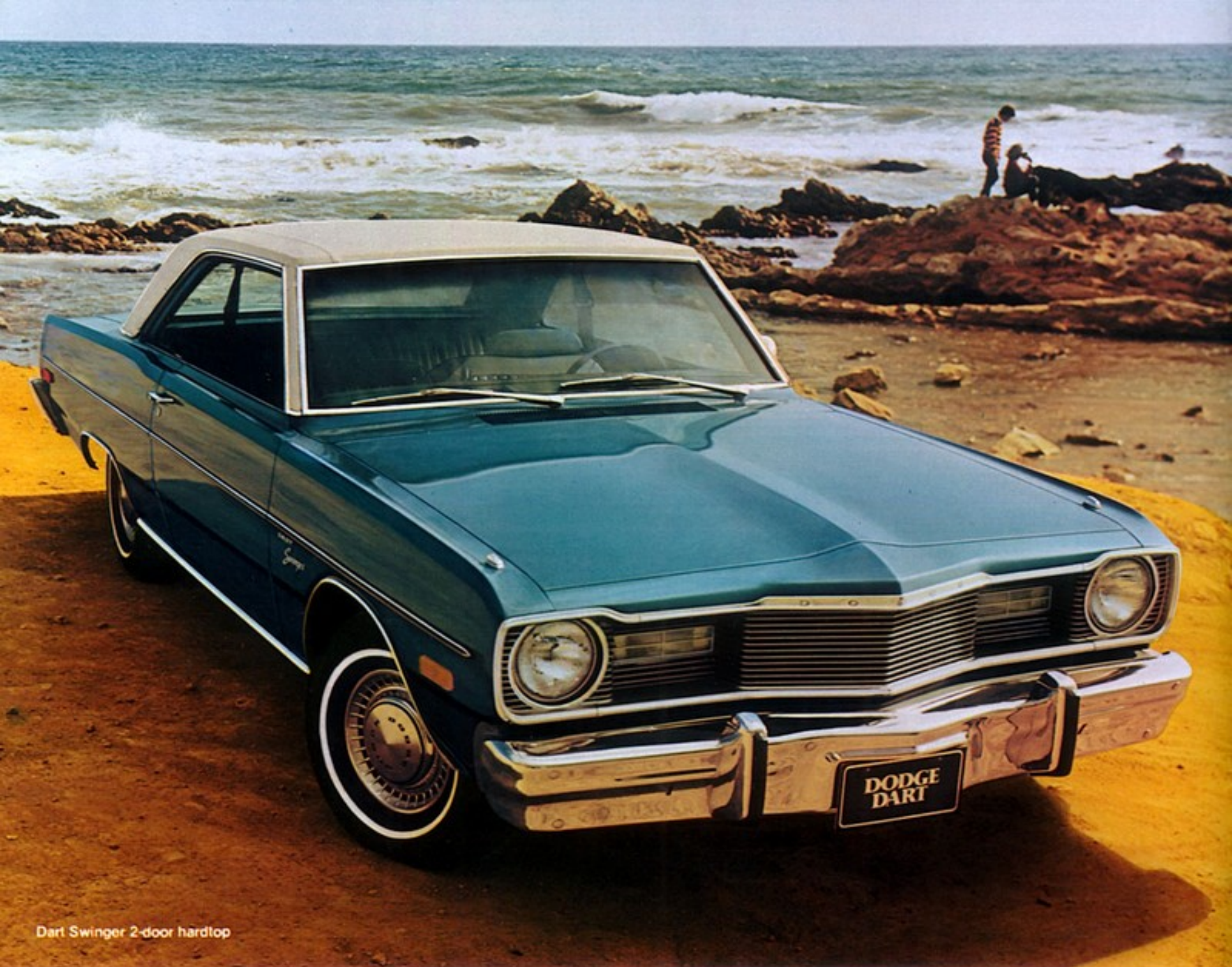
Dart Swinger 2-door hardtop