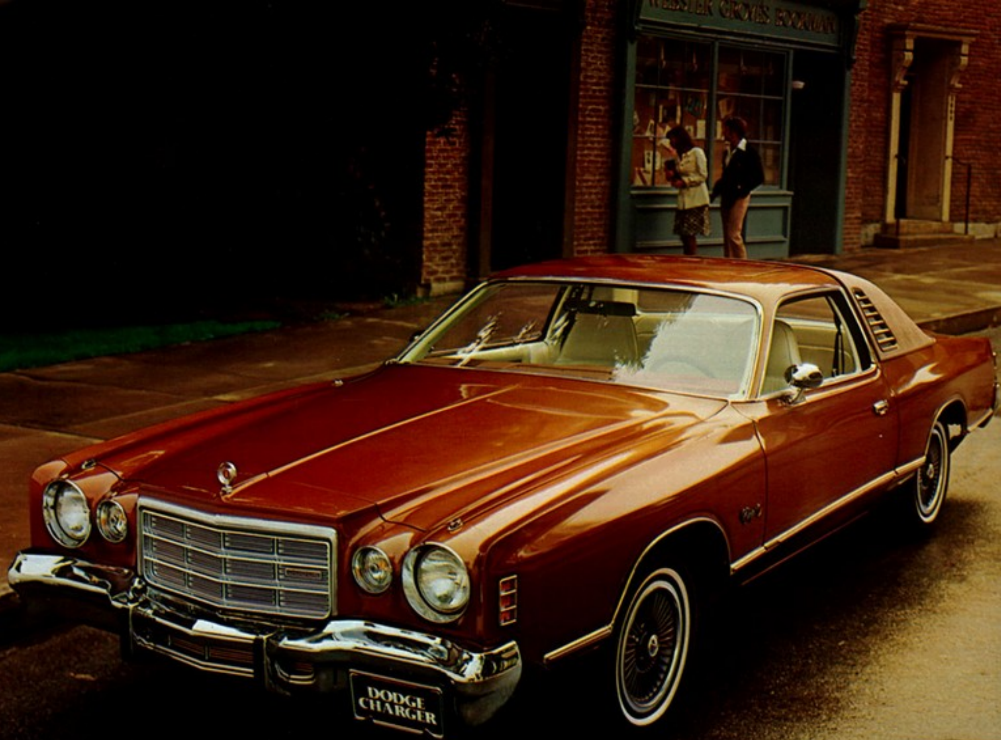
Charger Special Edition 2-door hardtop