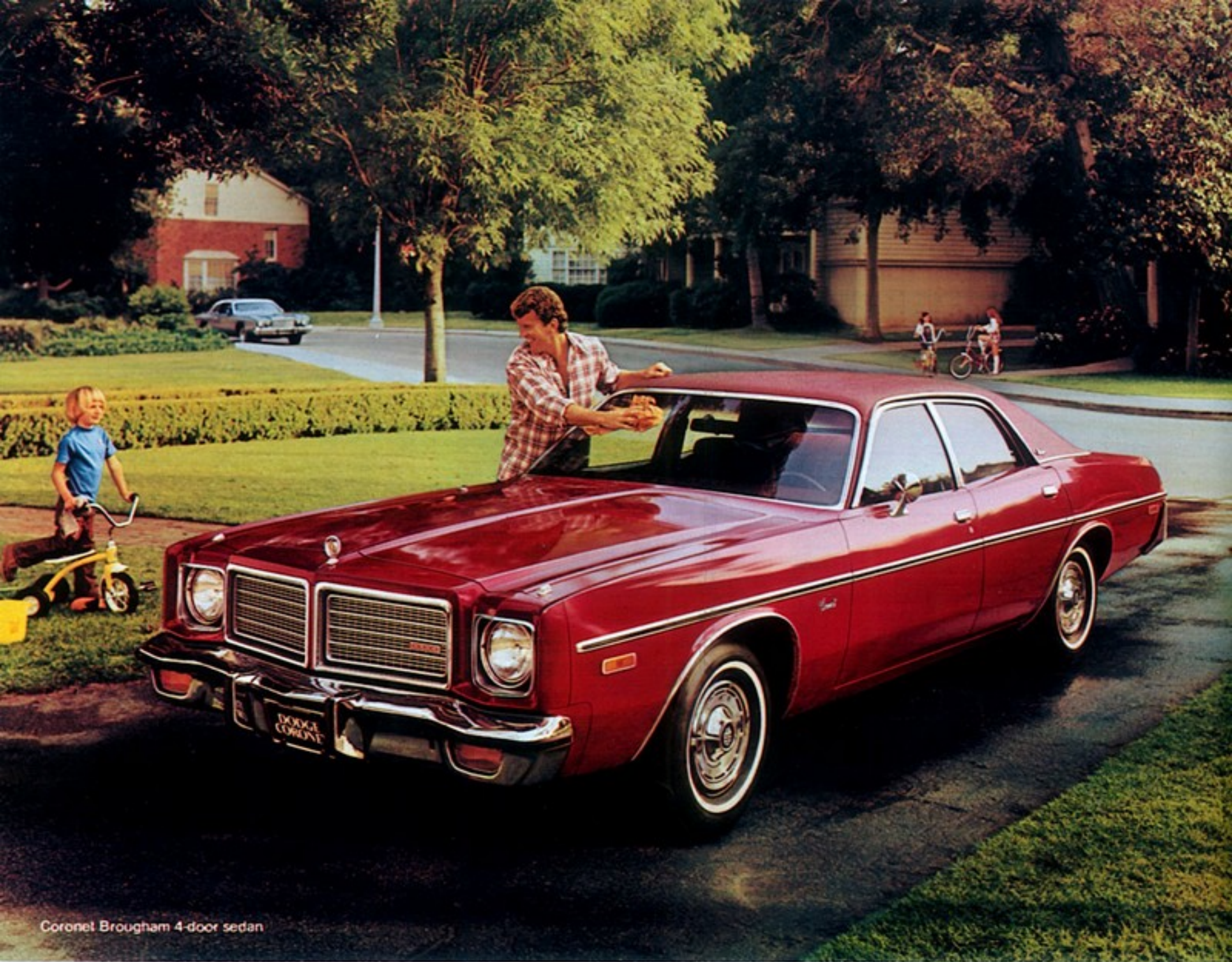
Coronet Brougham 4-door sedan

Coronet. A great family car because Dodge planned it that way.