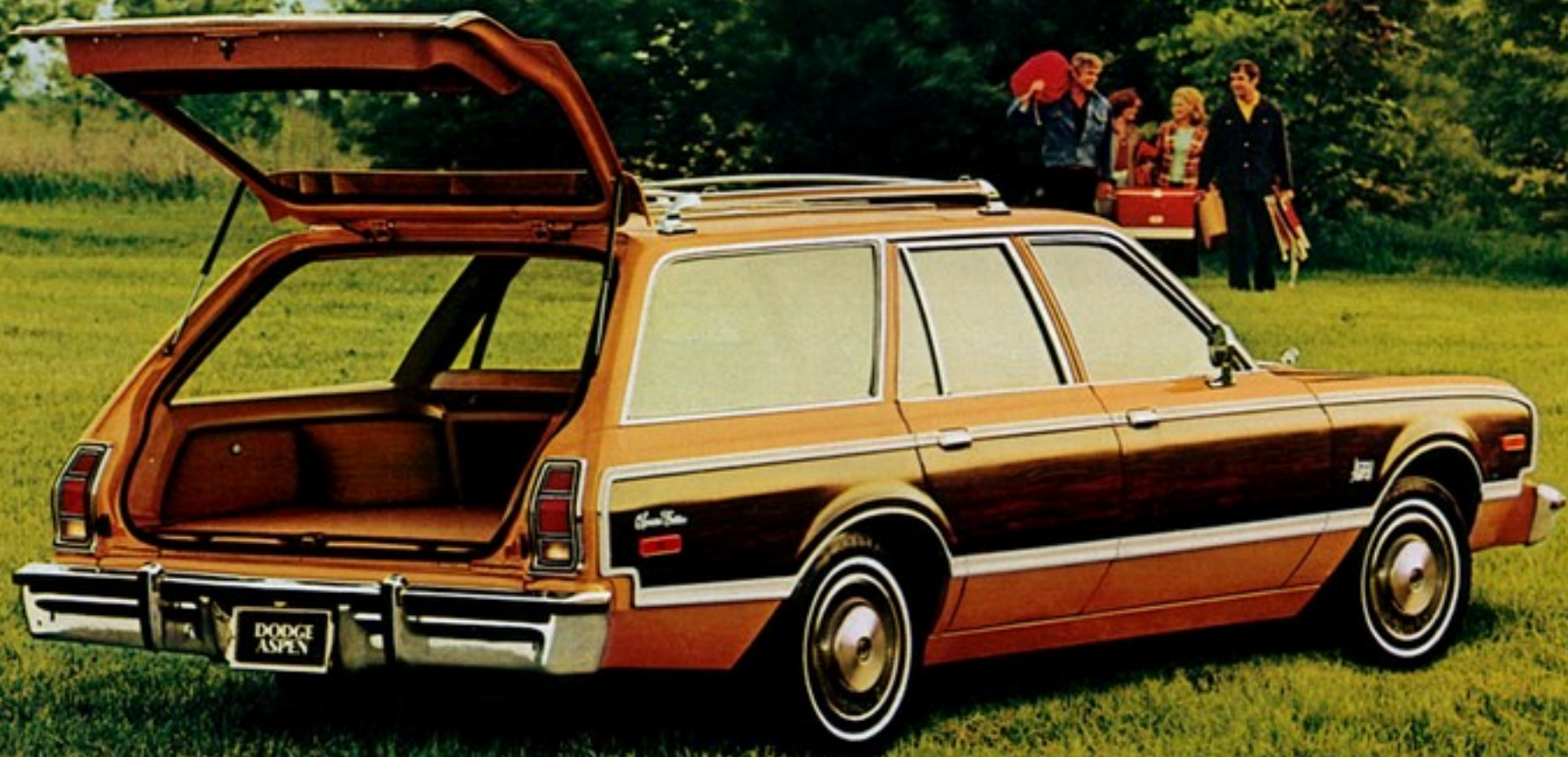
Aspen Special Edition wagon