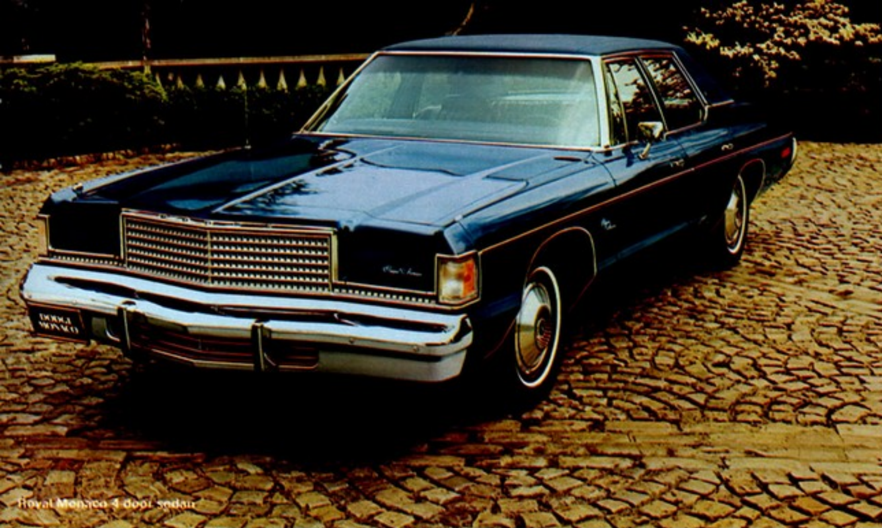
Royal Monaco 4 door sedan