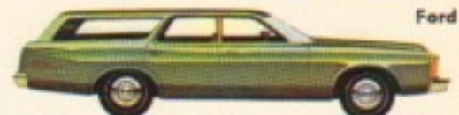
Custom 500 Ranch Wagon 6-Passenger (Color 4Q)