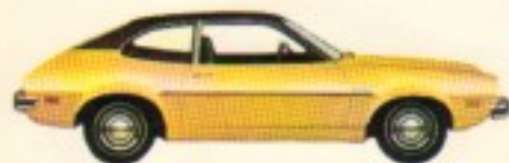
Pinto 2-Door Sedan (Color 6B)