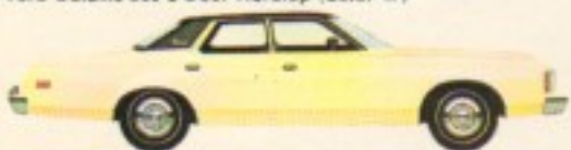
Ford Galaxie 500 4-Door Pillared Hardtop (Color 6D)