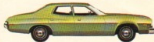
Torino 4-Door Filled Hardtop (Color 4C)