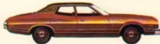
Gran Torino Brougham 4-Door Filled Hardtop (Color 5M)