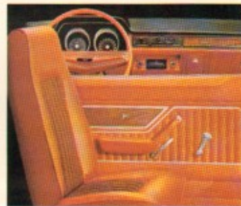
Luxurious Interior, Great Options: Sports Accent Group in Orange (Color BC) includes "super-soft" vinyl trim with Manston cloth insert, Deluxe 2-Spoke Steering Wheel, AM Radio.

Color codes indicated—example: (Color 6F) are in your Ford Dealer's 1973 Color and Trim Selections book. Ask to see it.