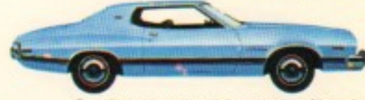
Gran Torino Brougham 2-Door Hardtop (Color 3K)