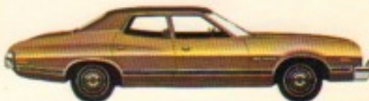
Gran Torino 4-Door Filled Hardtop (Color 5H)