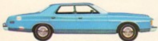
Ford Custom 500 4-Door Pillared Hardtop (Color 3K)