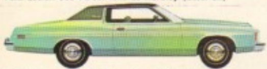
Ford Galaxie 500 2-Door Hardtop (Color 4P)