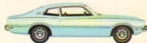
Maverick 2-Door Sedan (Color 3B)