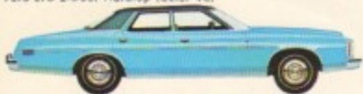
Ford LTD 4-Door Pillared Hardtop (Color 3D)