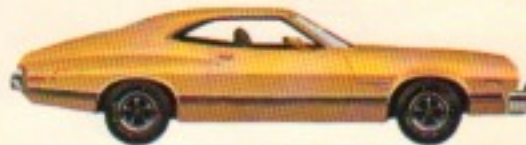
Gran Torino Sport SportsRoof (Color 6F)