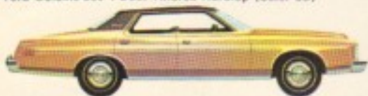
Ford Galaxie 500 4-Door Hardtop (Color 5H)