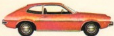
Pinto 3-Door Runabout (Color 2B)