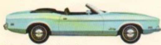
Mustang Convertible (Color 3B)