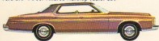
Ford LTD 4-Door Hardtop (Color 5J)