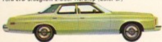
Ford LTD Brougham 4-Door Pillared Hardtop (Color 4B)