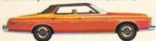
Ford LTD Brougham 4-Door Hardtop (Color 5M)