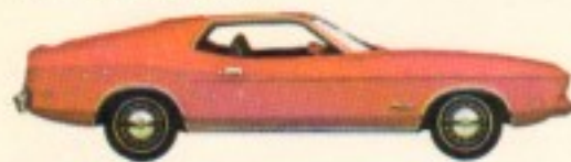
Mustang SportsRoof (Color 2B)