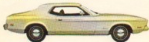
Mustang Hardtop (Color 5A)