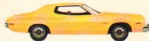
Torino 2-Door Hardtop (Color 6E)