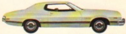
Gran Torino 2-Door Hardtop (Color 5A)