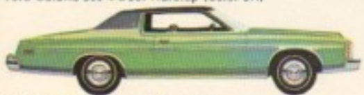
Ford LTD 2-Door Hardtop (Color 4C)