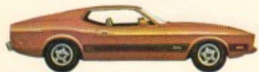
Mustang Mach I (Color 5M)