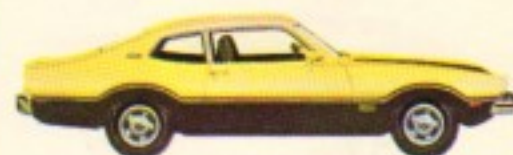
Maverick Grabber (Color 6E)