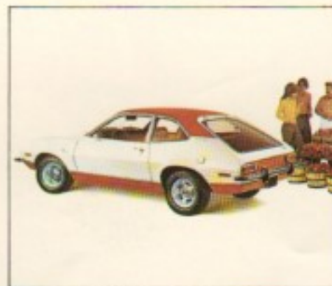
Pinto 3-Door Runabout (Color 9A) with optional Sports Accent Group, Dual Racing Mirrors, Forged Aluminum Wheels.

Other Standard Features: Functional — Direct Aire Ventilation • 3-Speed Heater • Front Bumper Guards • Locking Steering Column • Uni-Lock Shoulder/Lap Belts with Reminder System • Energy-Absorbing Bumper System • All Ford Motor Company Lifeguard Design Safety Features. Appearance & Comfort —High Back, Contoured All-Vinyl Seats • Floor Mats • Mini-Console • Parking Lamps, and more. 3-Door Runabout —Carpeting • Rear Door • Fold-Down Rear Seat.