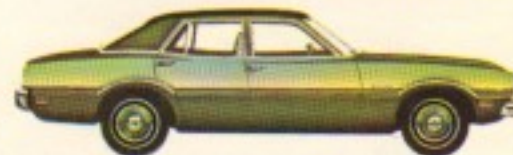
Maverick 4-Door Sedan (Color 4Q)