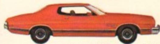
Gran Torino Sport 2-Door Hardtop (Color 2B)