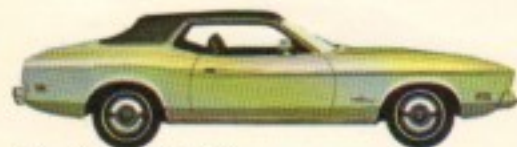
Mustang Grandé (Color 4P)