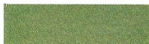
Med. Green Metallic