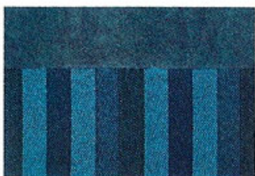
Interior: BLUE CAROUSEL STRIPE* Exterior: TAPE STRIPE—SILVER