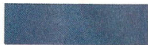
Med. Blue Metallic