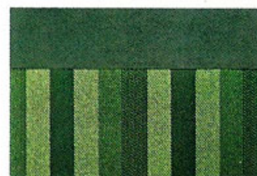
Interior: GREEN CAROUSEL STRIPE* Exterior: TAPE STRIPE—YELLOW