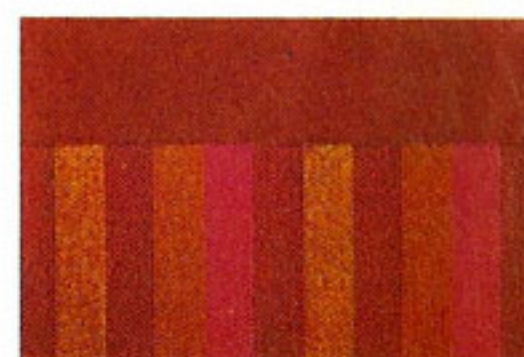
Interior: RED SPECTRUM STRIPE* Exterior: TAPE STRIPE—GOLD