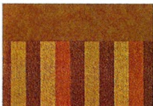
Interior: GINGER SPECTRUM STRIPE* Exterior: TAPE STRIPE—ORANGE