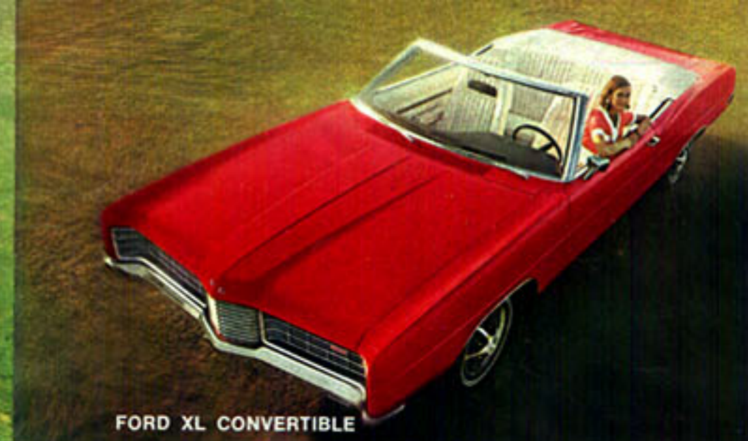
FORD XL CONVERTIBLE