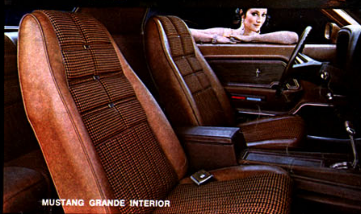
MUSTANG GRANDE INTERIOR