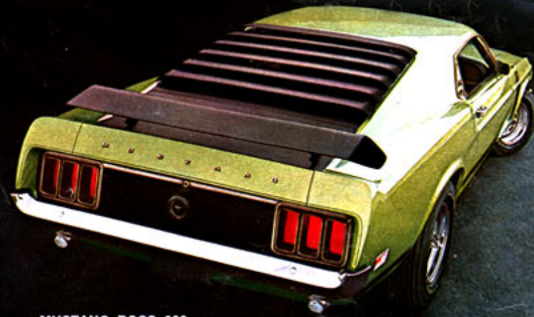
MUSTANG BOSS 302

BOSS 302 . . . when you like it quick. This one goes like the wild wind. All-out performance for adventurous souls who want to rule the road. A high-output Boss 302 4V V-8 winds up 290 ferocious horses. It has belted wide-oval tires, hub cap/trim ring, a front spoiler, and a space saver spare tire. Available are hot extras like the "shaker" hood scoop, adjustable rear deck spoiler, Sport Slats, and the close-ratio 4-speed with Hurst Shifter. Like all Mustangs, Boss is available in wild colors, too. And there's plenty more.