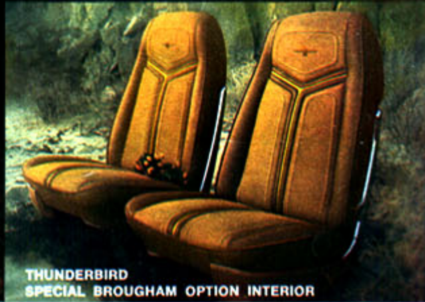
THUNDERBIRD SPECIAL BROUGHAM OPTION INTERIOR