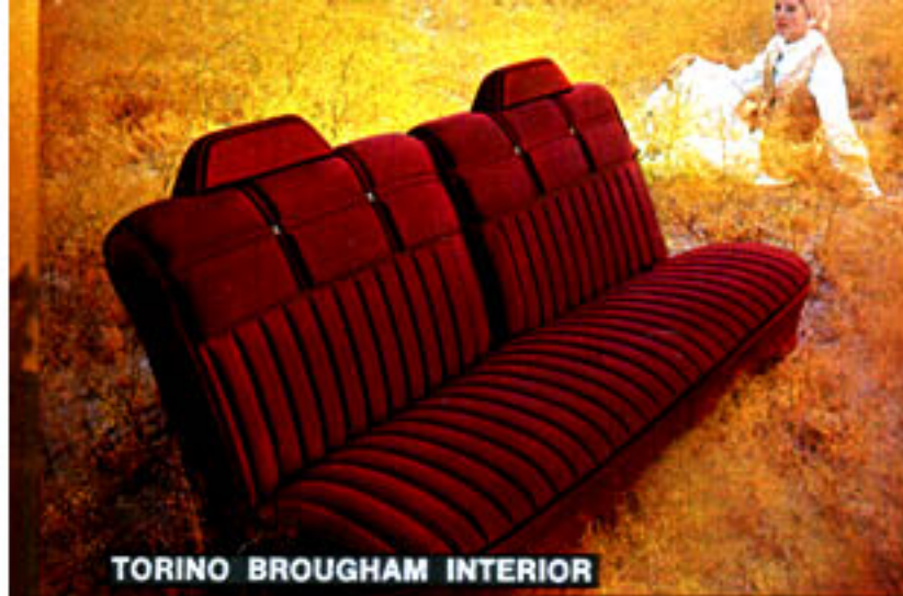
TORINO BROUGHAM INTERIOR

New Torino Broughams: The 2-Door and 4-Door Hardtop Broughams, distinctive new additions to the Torino series, introduce a whole new world of magnificence to the intermediate field. Contemporary styling, unmistakably top-of-the-line, is crisp, clean, rich-looking. Restrained chrome touches tastefully accent Brougham's gracefully sculptured proportions. New Hideaway Headlamps, standard, are discreetly molded into an impressive, jewel-like grille. Interiors are equally breathtaking. Incredibly luxurious. You are surrounded with elegant refinements. Plush carpeting is underfoot. Upholstery fabrics are rich and the selection is extensive. Better ideas abound. The