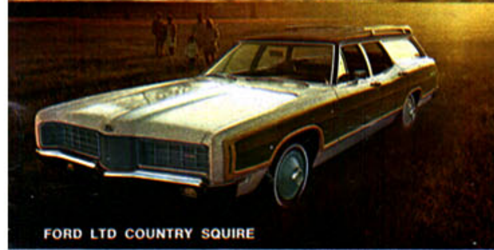
FORD LTD COUNTRY SQUIRE