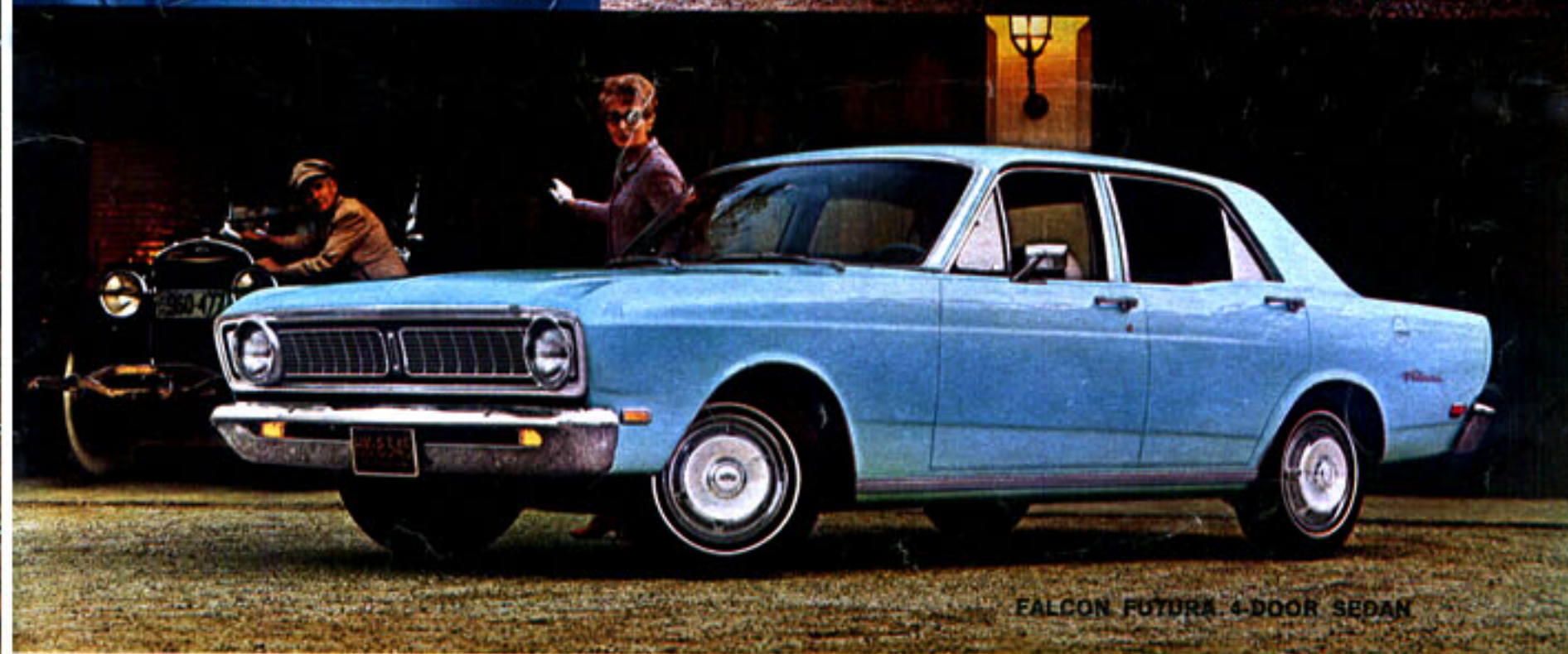
FALCON FUTURA 4-DOOR SEDAN