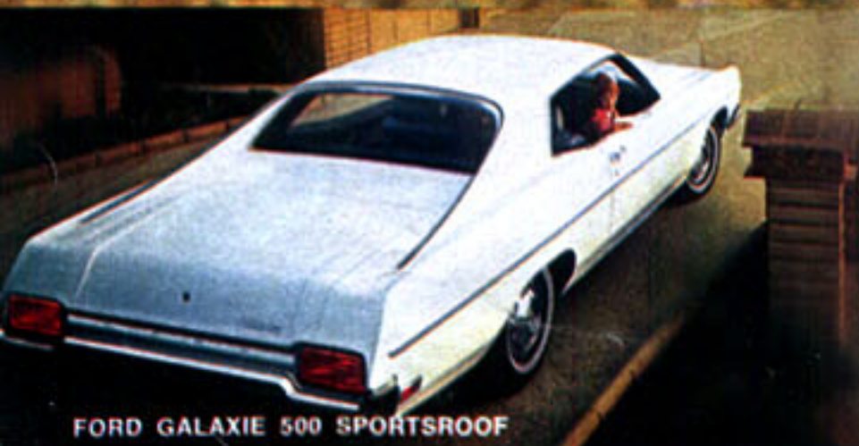
FORD GALAXIE 500 SPORTSROOF