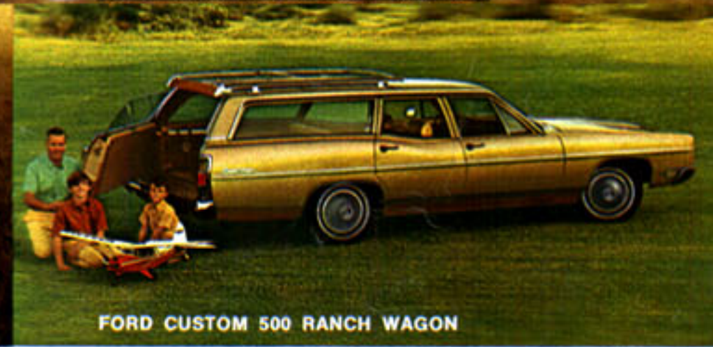
FORD CUSTOM 500 RANCH WAGON