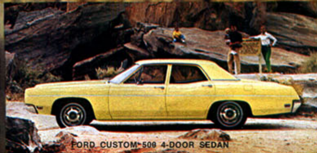
FORD CUSTOM 500 4-DOOR SEDAN