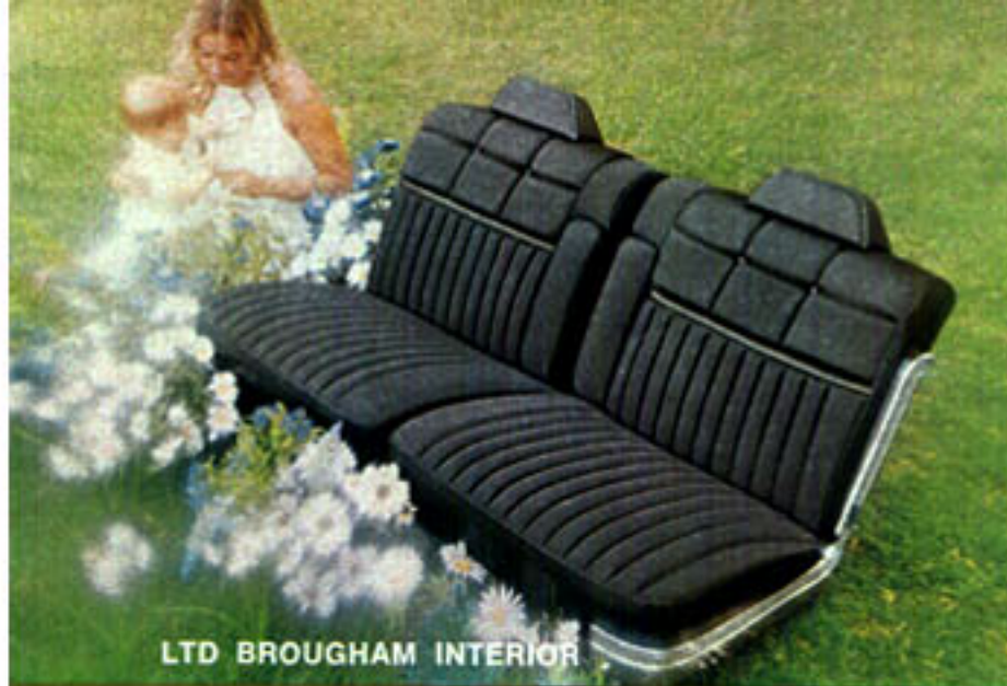
LTD BROUGHAM INTERIOR

LTD BROUGHAM . . . quietly superior. Ford presents this brand-new ultraluxury series . . . the most carefully crafted, most elegant Fords ever built. They are available as 2- or 4-Door Hardtops and a 4-Door Sedan. Their massive new grille,