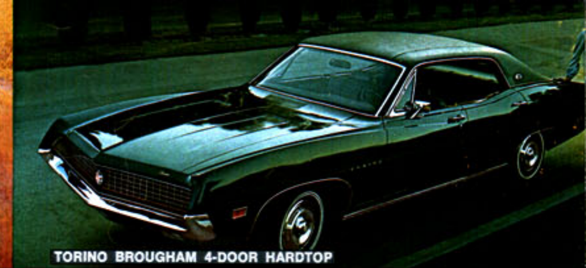
TORINO BROUGHAM 4-DOOR HARDTOP