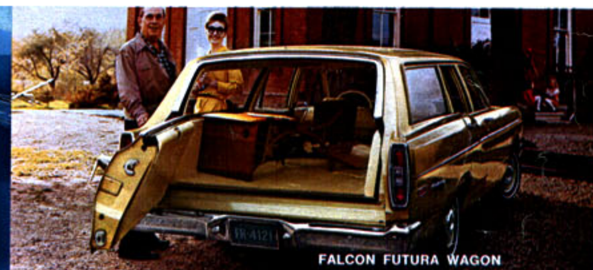
FALCON FUTURA WAGON