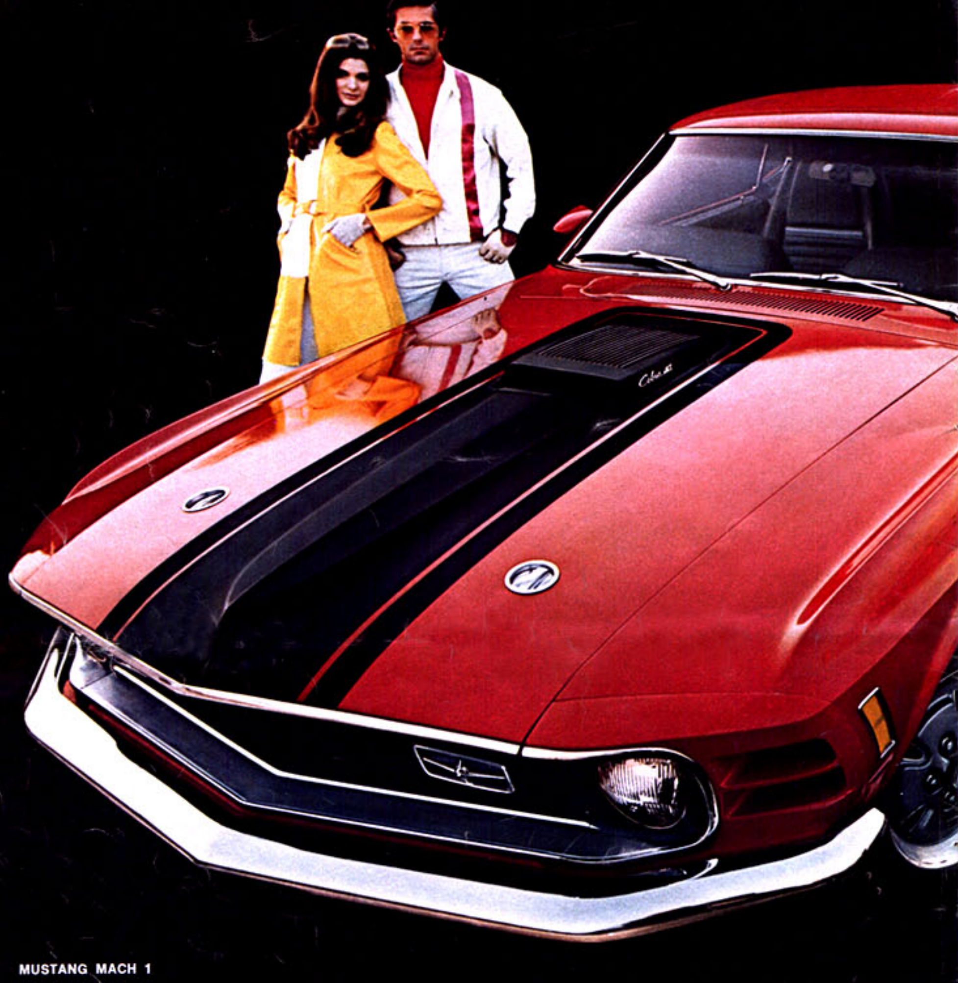
MUSTANG MACH 1