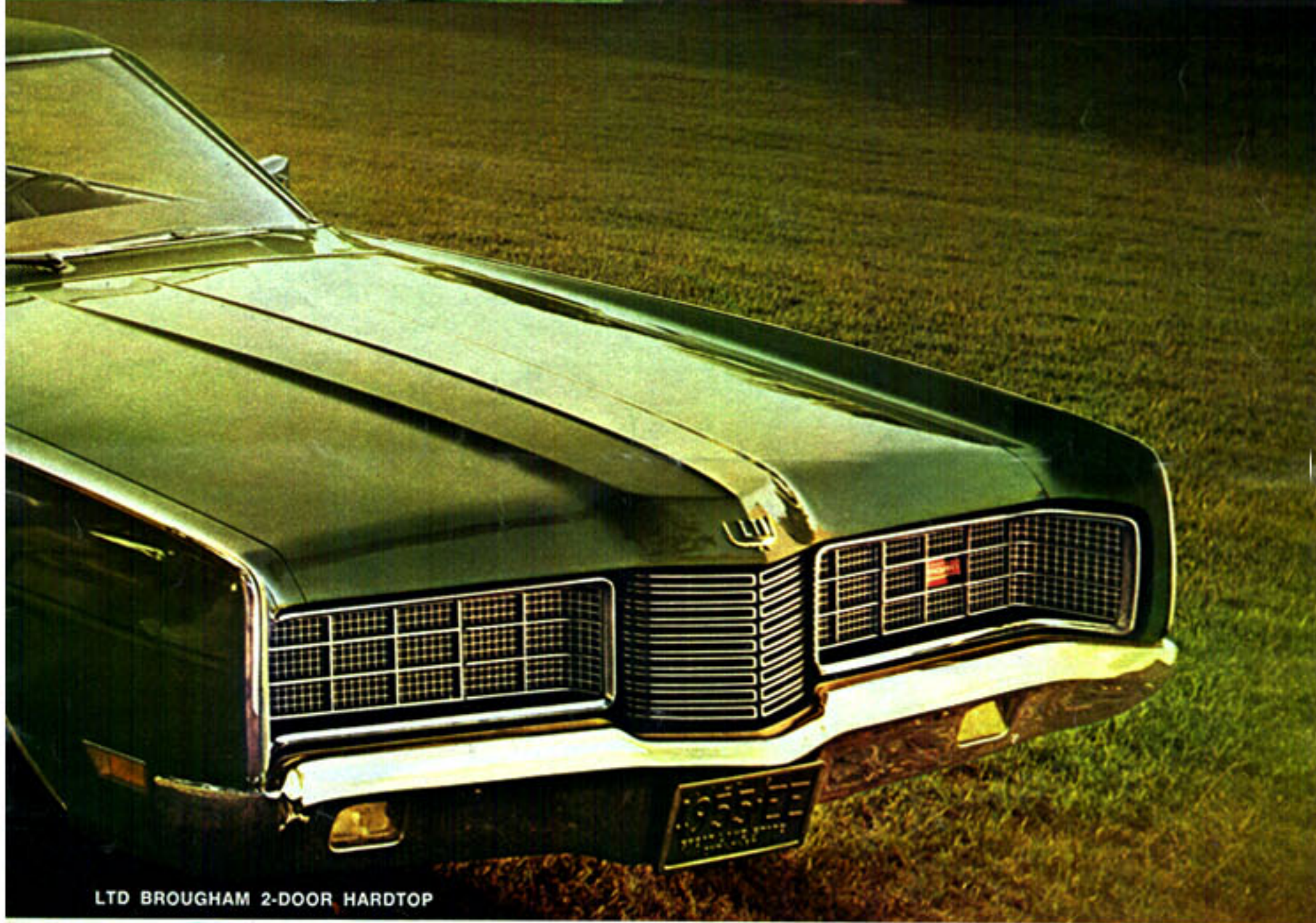
LTD BROUGHAM 2-DOOR HARDTOP

Hideaway Headlamps and special ornamentation distinguish them on the outside . . . and inside they offer the highest level of luxury ever available in Ford's field. Handsome woodtone trim. Rich knit-nylon fabrics. Deep cut 100% nylon carpeting, a Ford exclusive. Front seat center armrest. Special steering wheel. Five courtesy lights. Electric clock. Power front disc brakes. And much more. All of this is powered by a quietly spirited 351 V-8. And there is an extensive range of optional equipment available for even finer personalized luxury.