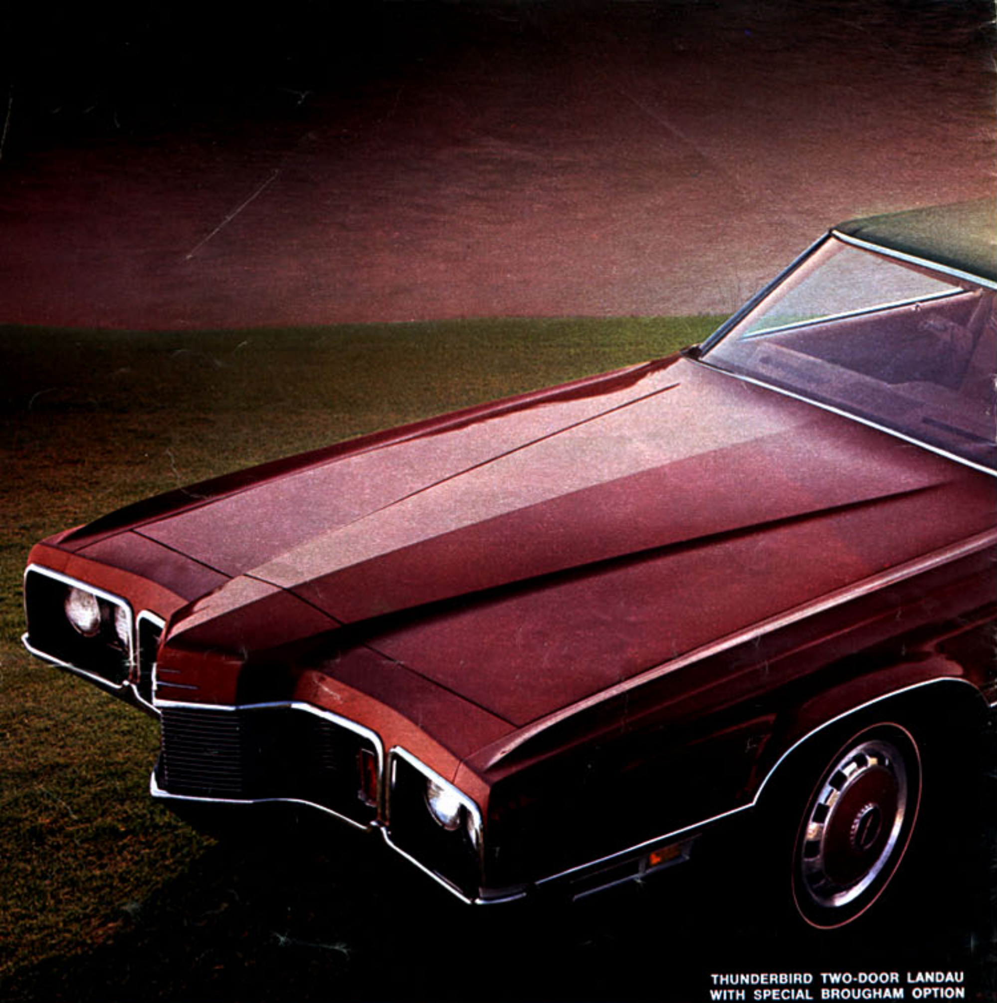
THUNDERBIRD TWO-DOOR LANDAU WITH SPECIAL BROUGHAM OPTION