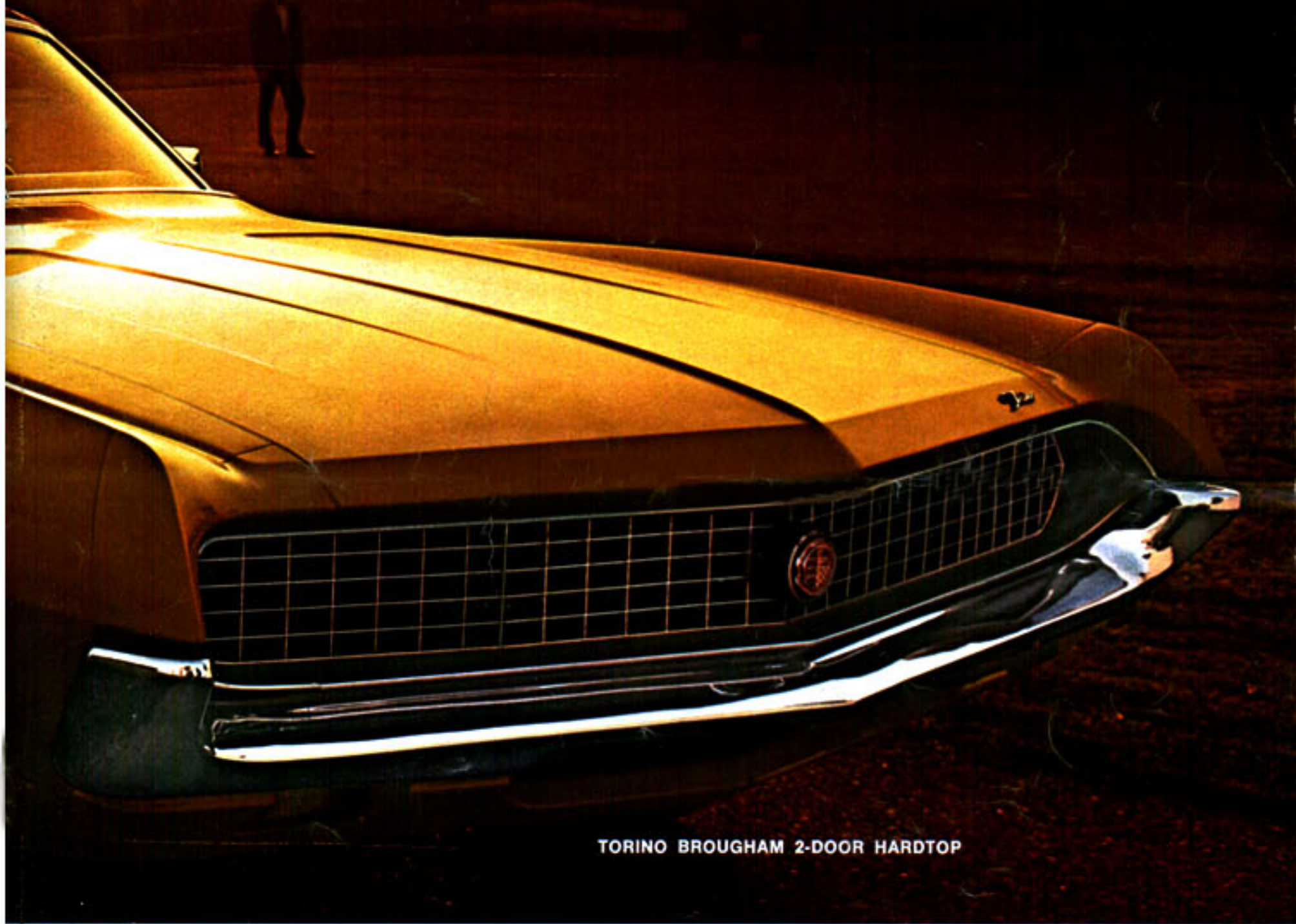
TORINO BROUGHAM 2-DOOR HARDTOP

vent windows on the 2-door hardtops, for instance, have been eliminated to do away with wind noise. Door release handles are a new design for added security. And options of an almost unbelievable variety permit precise tailoring to your taste. Other Torino models include the Torino 4-Door Sedan , Torino 2-Door Hardtop , and Torino 4-Door Hardtop . They're shaped and built and sized in the new-clear-through manner of every Torino and offer exceptional values at even lower than Brougham price. They make great family cars in town or out, and are easy to handle, easy to park. A longer wheelbase and wider stance give you a remarkably smooth, quiet ride.