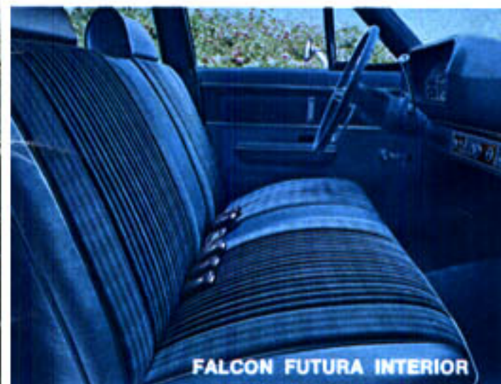
FALCON FUTURA INTERIOR

Economize without giving up a thing in a new 1970 Falcon. Spacious inside, compact outside, Falcon combines big-car ride with easy, small-car handling. Performance is snappy and eager. Gas mileage, something to write home about. The Futura Club Coupe and 4-Door Sedan are the last word in compact luxury and big-car ideas. The Falcon 4-Door Sedan and Club Coupe are downright king-sized when it comes to savings. Falcon and Futura Wagons tote almost as much as any full-sized wagon (85.2 cu. ft.). And every Falcon model is built to the rigid quality standards of the higher priced Fords. Standard Falcon features include: 111-inch wheelbase (113" on wagons); Ford's big 200-cu. in. Six; fully synchronized manual 3-speed transmission; and Ford's LifeGuard Design Safety Features. Options include: 302 V-8; SelectShift; Select-Aire Conditioner; Power Steering; AM Radio, and many more.