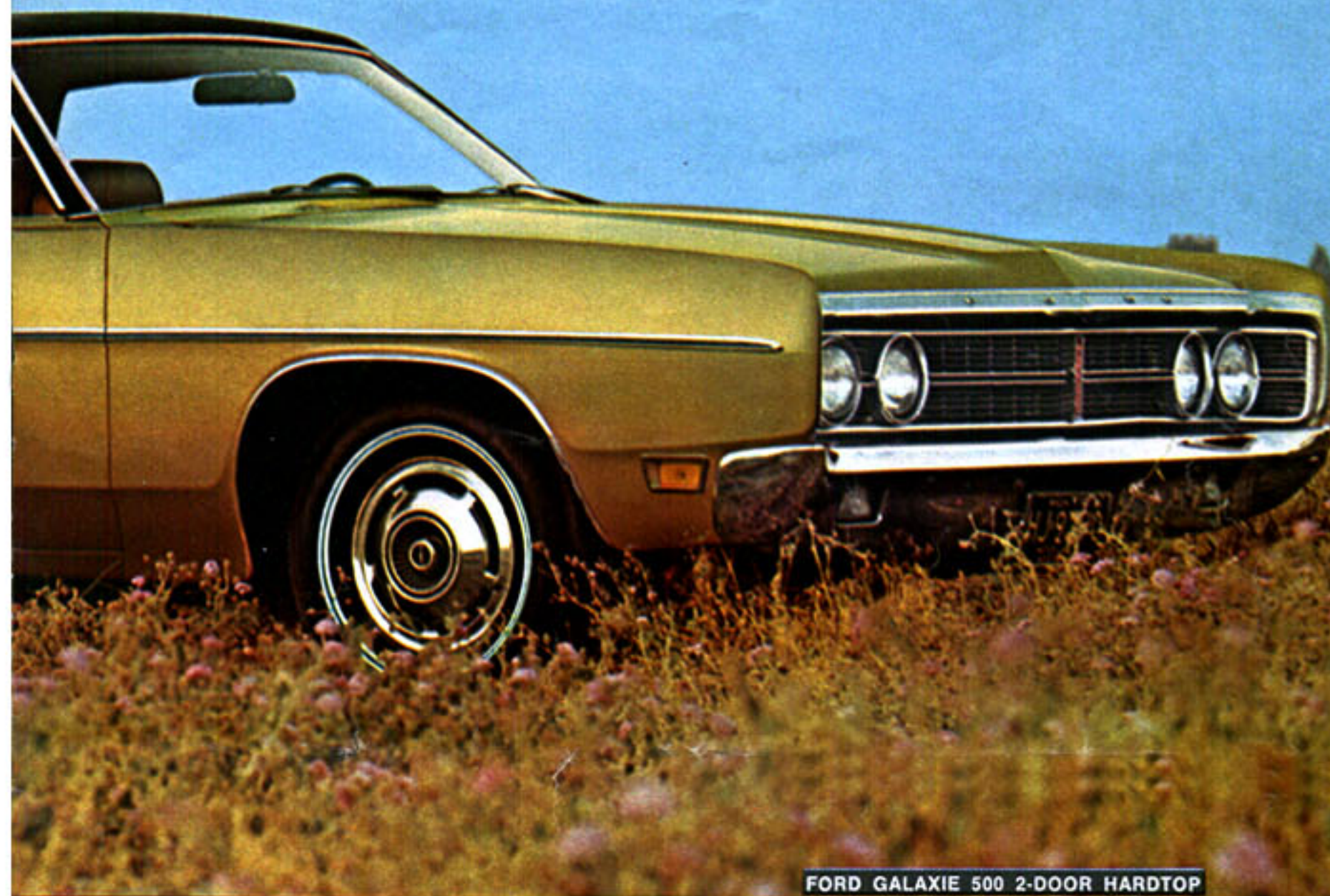
FORD GALAXIE 500 2-DOOR HARDTOP