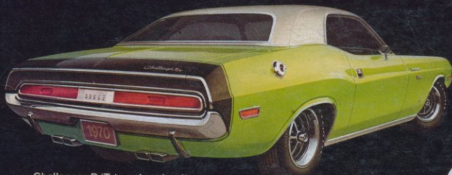
Challenger R/T two-door hardtop