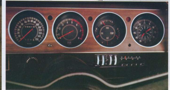
Nine-gauge lineup including trip odometer, tach, oil-pressure gauge, and clock.