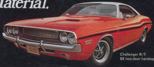
Challenger R/T SE two-door hardtop