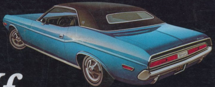
Challenger SE two-door hardtop

If you're the kind of person this car says you are, you could be Dodge Material.