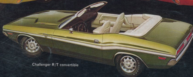
Challenger R/T convertible