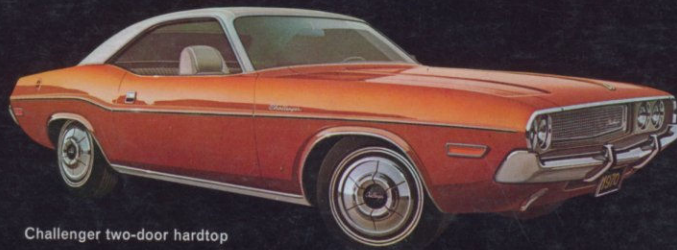
Challenger two-door hardtop