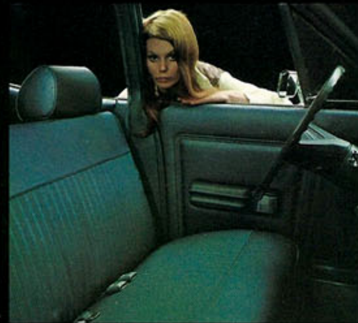
Handsome all-vinyl interior with matching trim comes in black and medium blue (all models), plus light nugget on Sedans, medium ginger on Wagon.

Falcon '70½ adds up to economy that never looked or felt so good. Test-drive one soon at your Ford Dealer's and prove it to yourself.