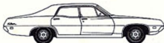
FALCON '70½ 4-DOOR SEDAN