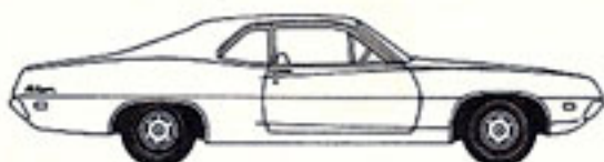
FALCON '70½ 2-DOOR SEDAN

While the information shown herein was correct when approved for printing, Ford Division reserves the right to discontinue, or change at any time, specifications or designs without incurring any obligations. Some features shown or described are optional at extra cost.