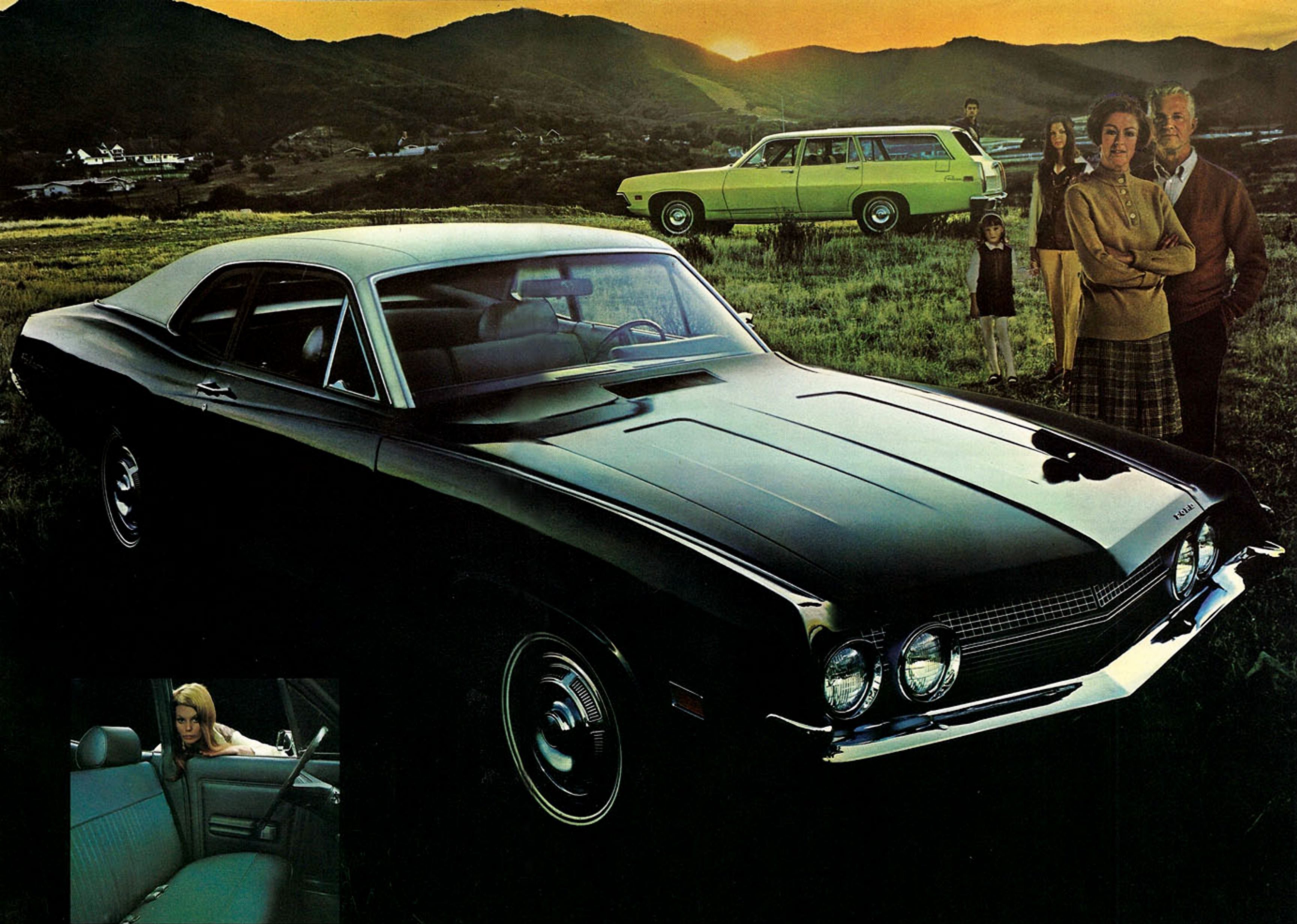
Beautiful new Falcon '70½ 2-Door Sedan, 4-Door Wagon (above), 4-Door Sedan shown on cover.