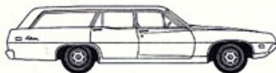
FALCON '70½ WAGON