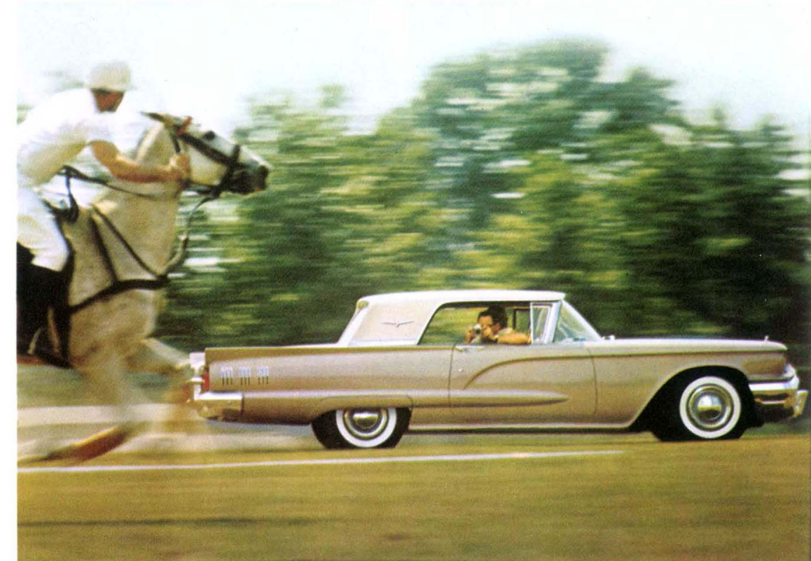
Thunderbird owners are perfectionists. They have, in their T-birds, the world's most admired car and a spectacular performer—the car everyone would love to own!

And yet, you'll find the 1960 Thunderbird costs less—far less—than other luxury cars!