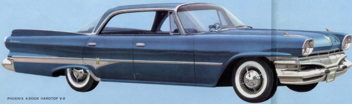
PHOENIX 4-DOOR HARDTOP V-8

There is no mistaking that the Phoenix is the top line of the Dodge Dart cars. It has luxury and prestige written on every sleek, rakish line. You can drive the Phoenix anywhere , park it next to anything with the smuggest, most self-satisfied feeling in the world. The Phoenix leaves nothing to be desired. It is completely satisfying to own and to drive.