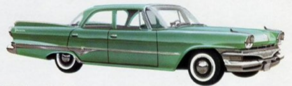
PHOENIX 4-DOOR SEDAN V-8