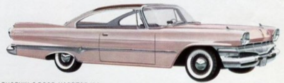
PHOENIX 2-DOOR HARDTOP V-8