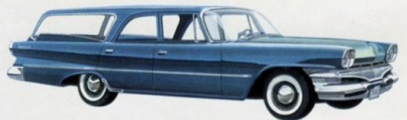
SENECA 4-DOOR 6-PASSENGER STATION WAGON, V-8 OR "6"

Great news for station wagon buyers—a low-price Dodge Dart wagon! Owning a station wagon was never easier! This beautiful Dodge Dart Seneca is priced right down with the lowest priced station wagon models in the low-price field. But what a difference in what you get for your money! The Dodge Dart gives you a whole host of exciting station wagon features: Rear-facing "Observation Lounge". Fold-down third seat. One-piece tailgate with roll-down rear window. All this plus such great engineering advances as Torsion-Aire Ride, Total-Contact Brakes and the roomiest interiors in the field!