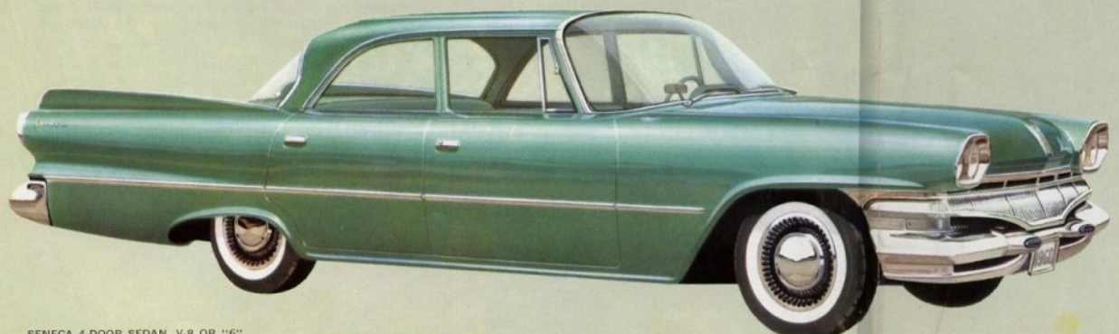
SENECA 4-DOOR SEDAN, V-8 OR "6"

The Seneca Series is the lowest priced line of Dodge Dart cars. Yet, in addition to the obvious savings in initial cost, there are many other reasons that make it a wonderful buy. Important reasons like its crisp, clean style, relaxing new riding comfort, money-saving durability and operating economy. They're all built right into this surprising Seneca to a degree that makes you wonder how it can be so modestly priced.