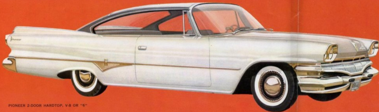
PIONEER 2-DOOR HARDTOP, V-8 OR "6"

If you have a flair for the dramatic, a keen appreciation for sleek lines, smart appointments, spirited performance—yet have a strong, practical nature as well—you need look no further than the Dodge Dart Pioneer. There just isn't a better or more logical choice. The Pioneer gives you the extra smartness and elegance you like, at a price you're willing to pay.