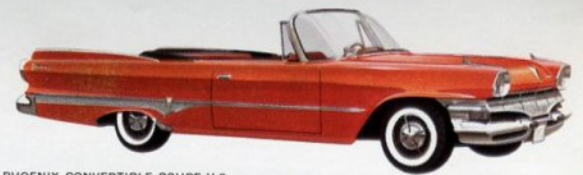
PHOENIX CONVERTIBLE COUPE V-8