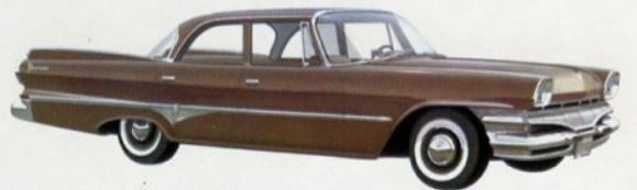
PIONEER 4-DOOR SEDAN, V-8 OR "6"