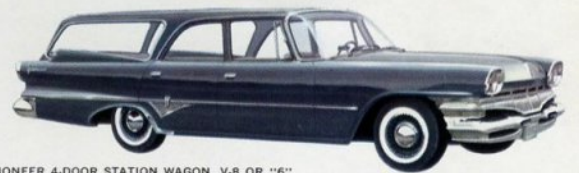
PIONEER 4-DOOR STATION WAGON, V-8 OR "6" (AVAILABLE IN 6- AND 9-PASSENGER MODELS)