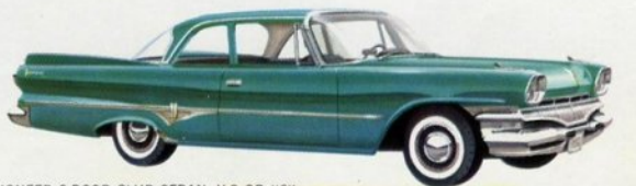
PIONEER 2-DOOR CLUB SEDAN, V-8 OR "6"