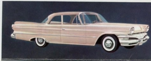
SENECA 2-DOOR SEDAN, V-8 OR "6"

Great news for station wagon buyers—a low-price Dodge Dart wagon! Owning a station wagon was never easier! This beautiful Dodge Dart Seneca is priced right down with the lowest priced station wagon models in the low-price field. But what a difference in what you get for your money! The Dodge Dart gives you a whole host of exciting station wagon features: Rear-facing "Observation Lounge". Fold-down third seat. One-piece tailgate with roll-down rear window. All this plus such great engineering advances as Torsion-Aire Ride, Total-Contact Brakes and the roomiest interiors in the field!