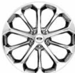
20" Polished Aluminum Available