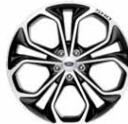
20" Machined and Painted Aluminum Available