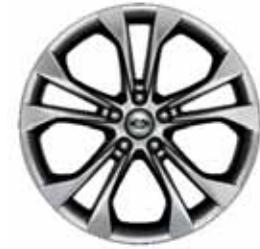
19" Premium Luster Nickel-Painted Aluminum Standard