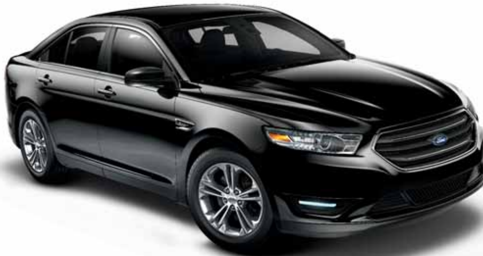
SEL. Tuxedo Black Metallic.

Visit accessories.ford.com to shop the complete collection