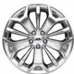
19" Premium Luster Nickel-Painted Aluminum Standard

1 Dune Leather with Perforated Inserts – Standard 2 Charcoal Black Leather with Perforated Inserts – Standard