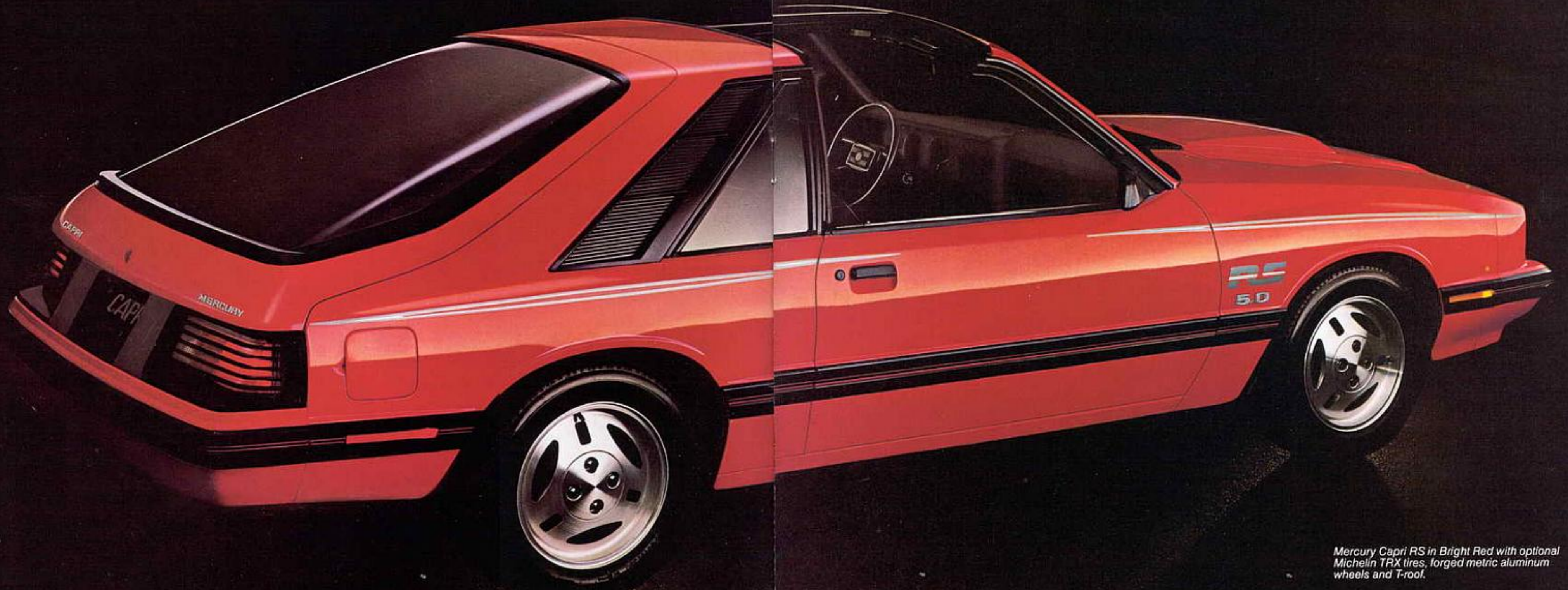
Mercury Capri RS in Bright Red with optional Michelin TRX tires, forged metric aluminum wheels and T-roof.