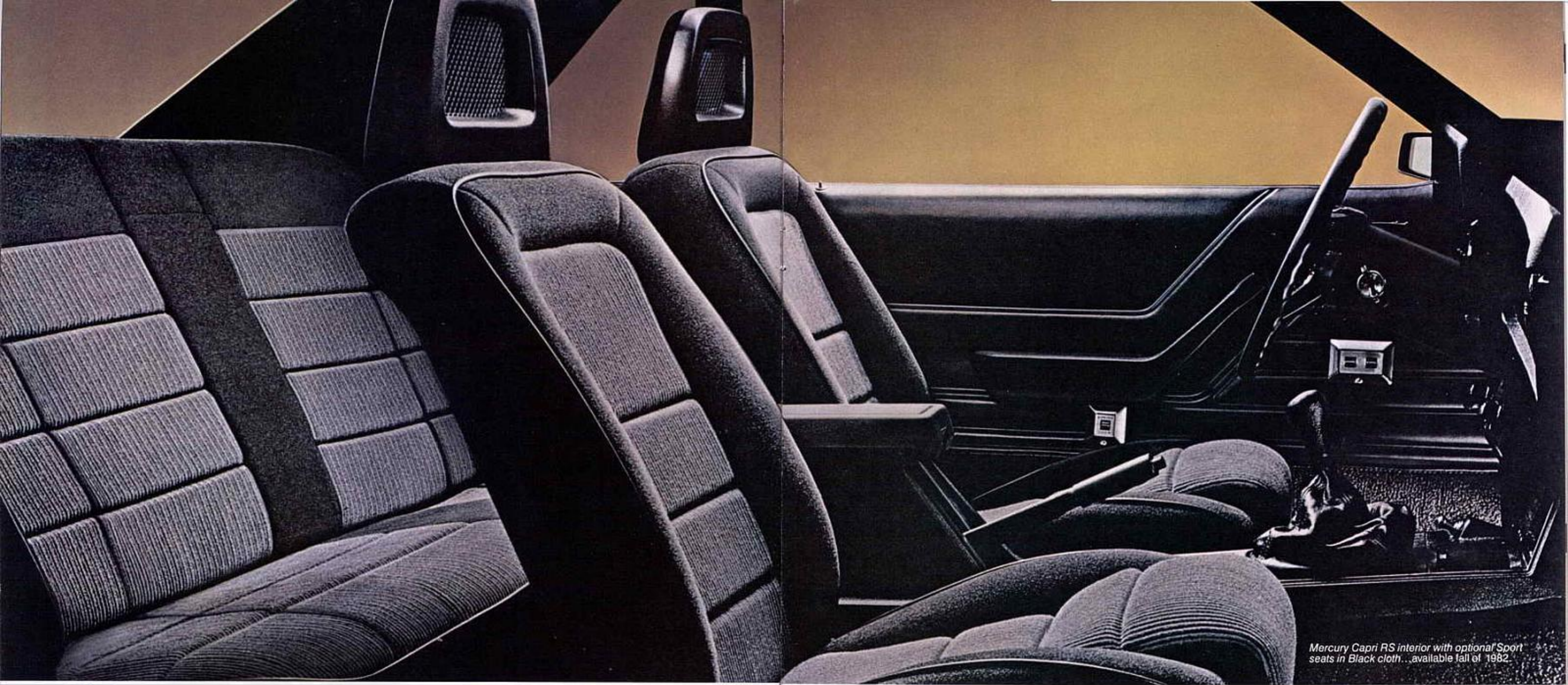
Mercury Capri RS interior with optional Sport seats in Black cloth...available fall of 1982.