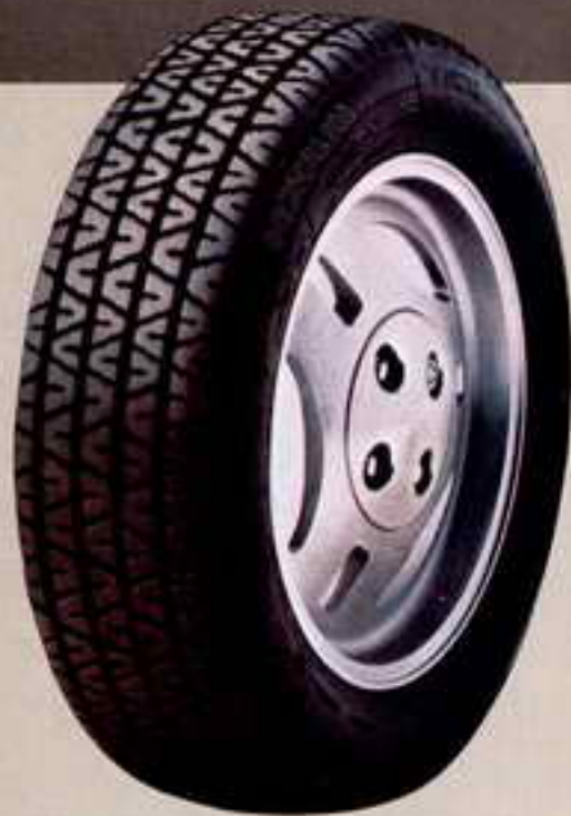
MICHELIN TRX RADIAL TIRES and three-spoke 390mm forged metric aluminum wheels put more sport in your driving. (Standard in Gold on Black Magic.)