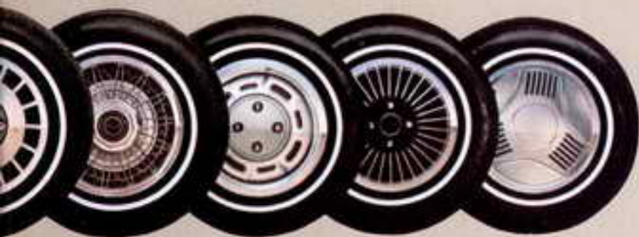
wheels (standard on Black Magic in Gold); cast aluminum wheels; wire wheel covers; styled steel