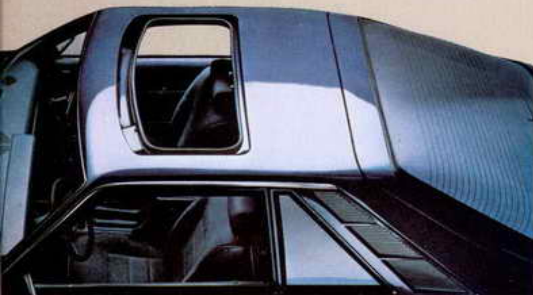
FLIP-UP OPEN AIR ROOF. Easy-to-handle feature lets the