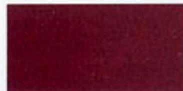
Dark Red Metallic*

Dual-Shade combinations: Black/Light Pewter Metallic · Dark Maroon/Silver Metallic · Dark Cordovan Metallic/Bittersweet Metallic · Dark Blue Metallic/Light Pewter Metallic · Dark Champagne Metallic/Medium Fawn Metallic