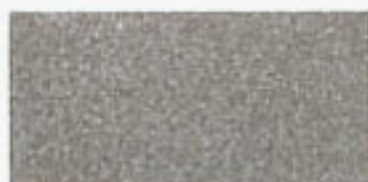
Medium Pewter Metallic*