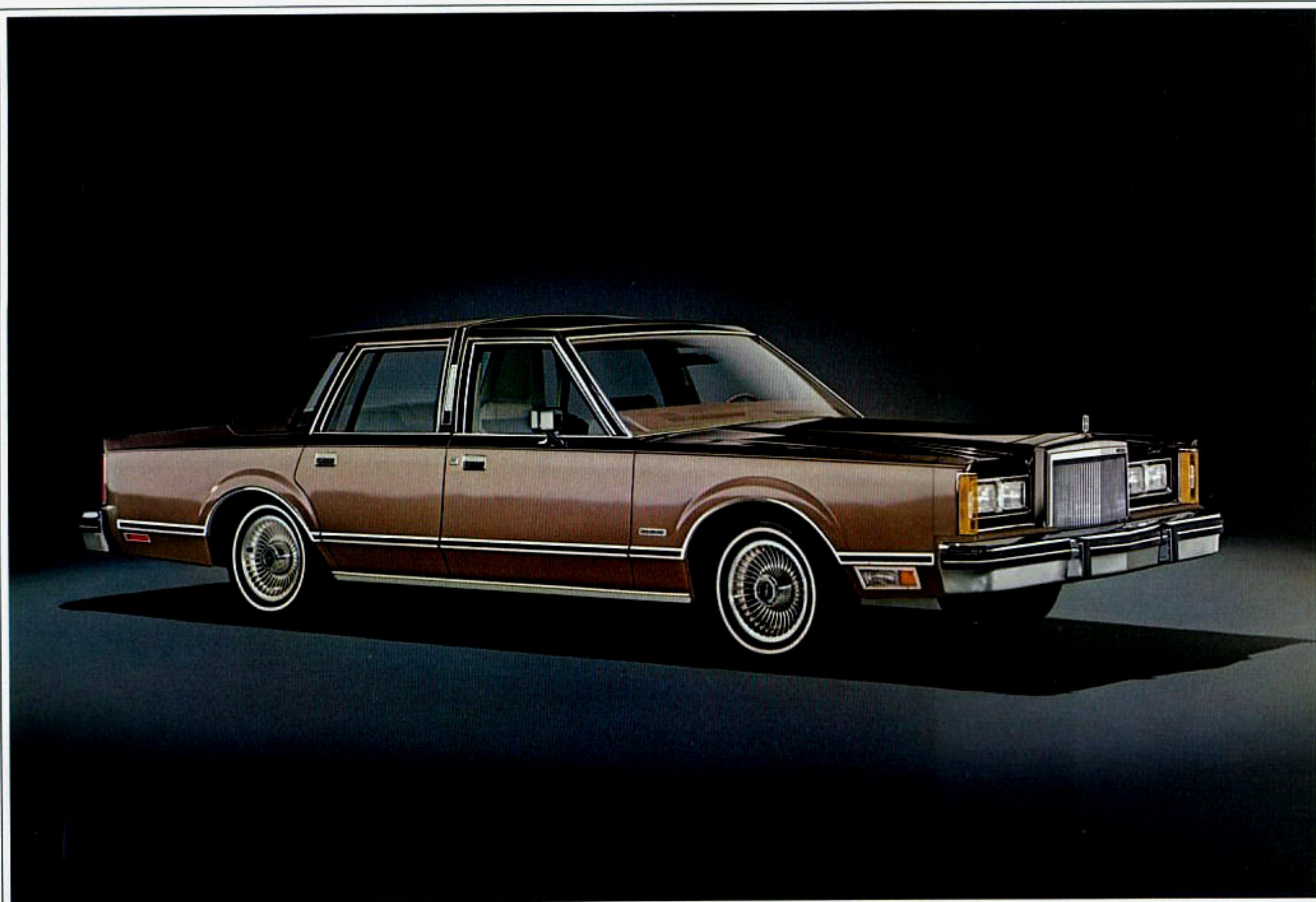
The 1980 Lincoln Continental 4-Door Sedan