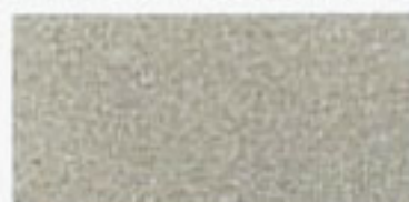
Light Pewter Metallic*