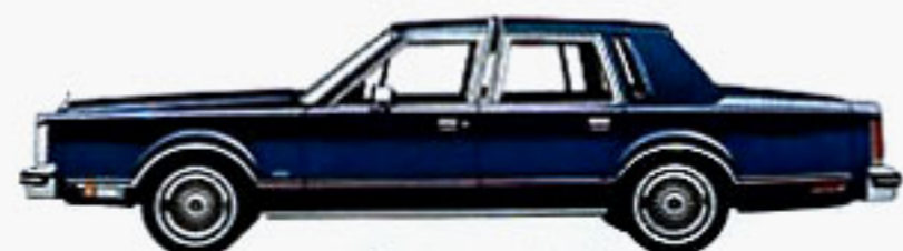
Lincoln Continental 4-Door