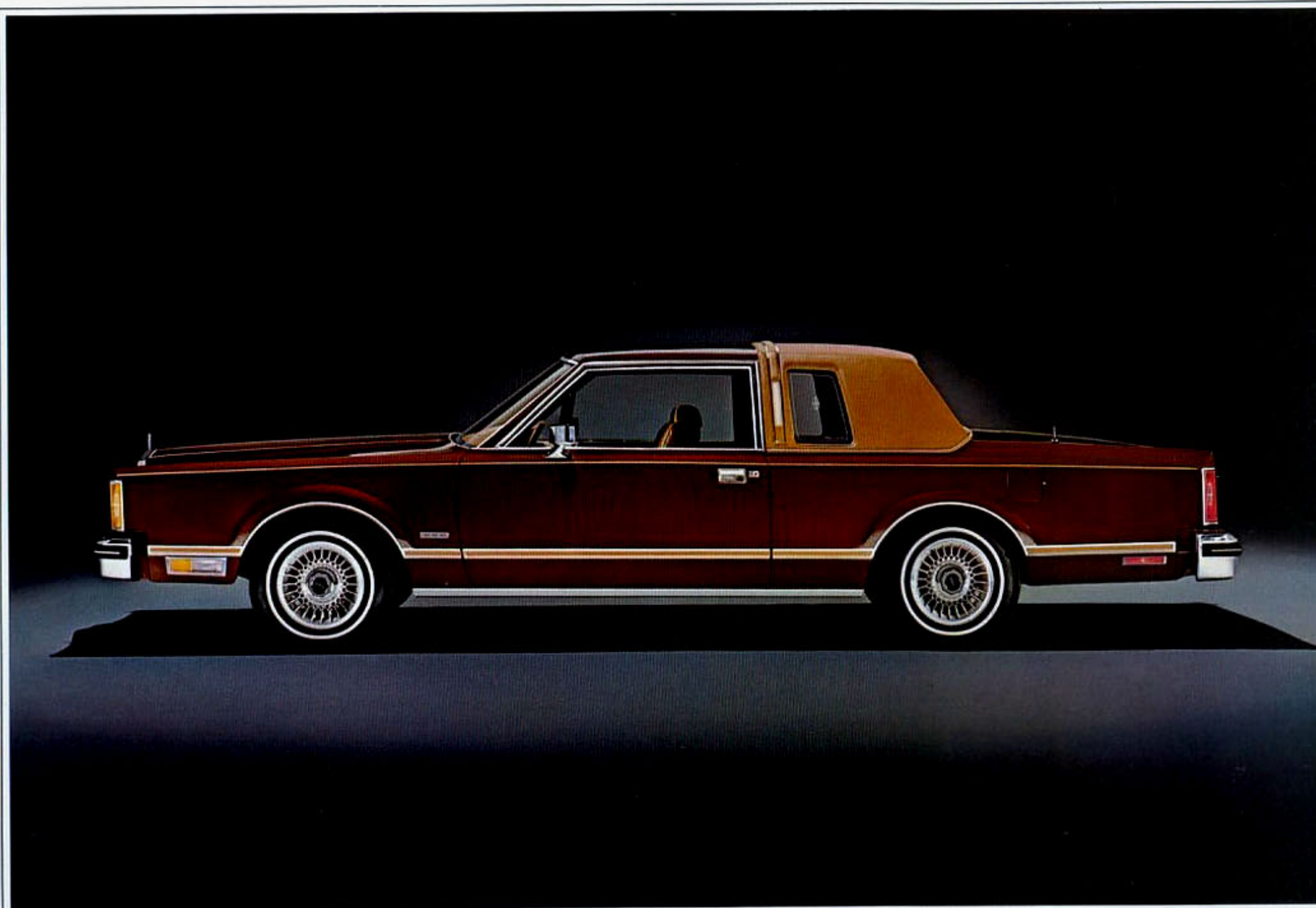
The 1980 Lincoln Continental Town Coupé

Standard features in the Town Coupé are the same as those in the Town Car. Optional features shown on the pictured Town Coupé are: Coach roof, premium bodyside moldings, lacy spoke aluminum wheels, and Illuminated Entry System.