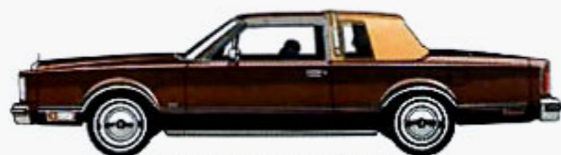
Lincoln Continental 2-Door