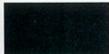
Dark Pine Metallic*