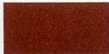
Dark Chamois Metallic*