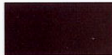
Dark Cordovan Metallic*