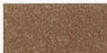
Medium Fawn Metallic*