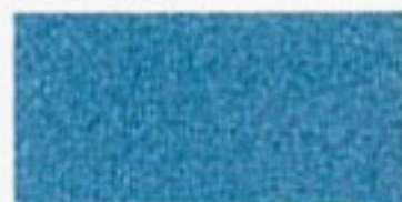
Diamond Blue Metallic*