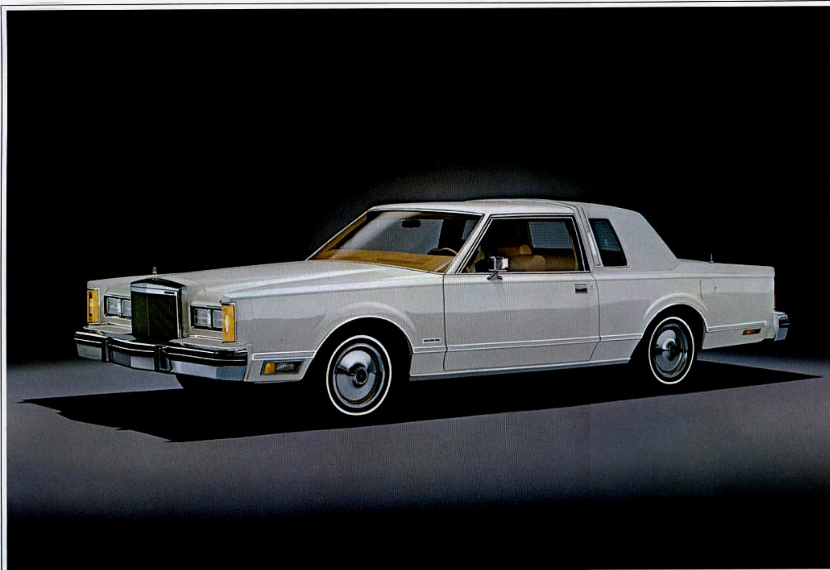
The 1980 Lincoln Continental Coupé