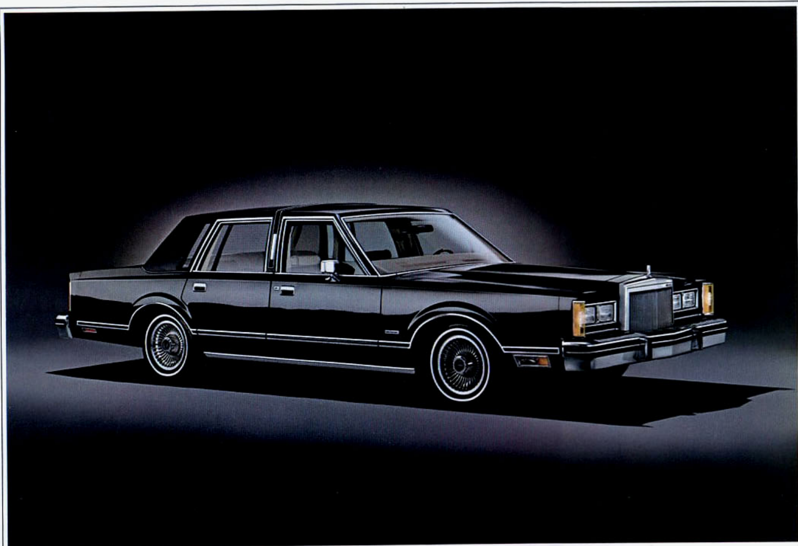
The 1980 Lincoln Continental Town Car