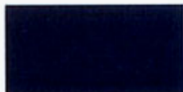
Dark Blue Metallic*