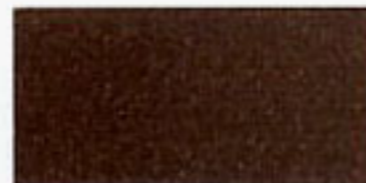
Dark Champagne Metallic*