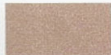
Light Fawn Metallic*